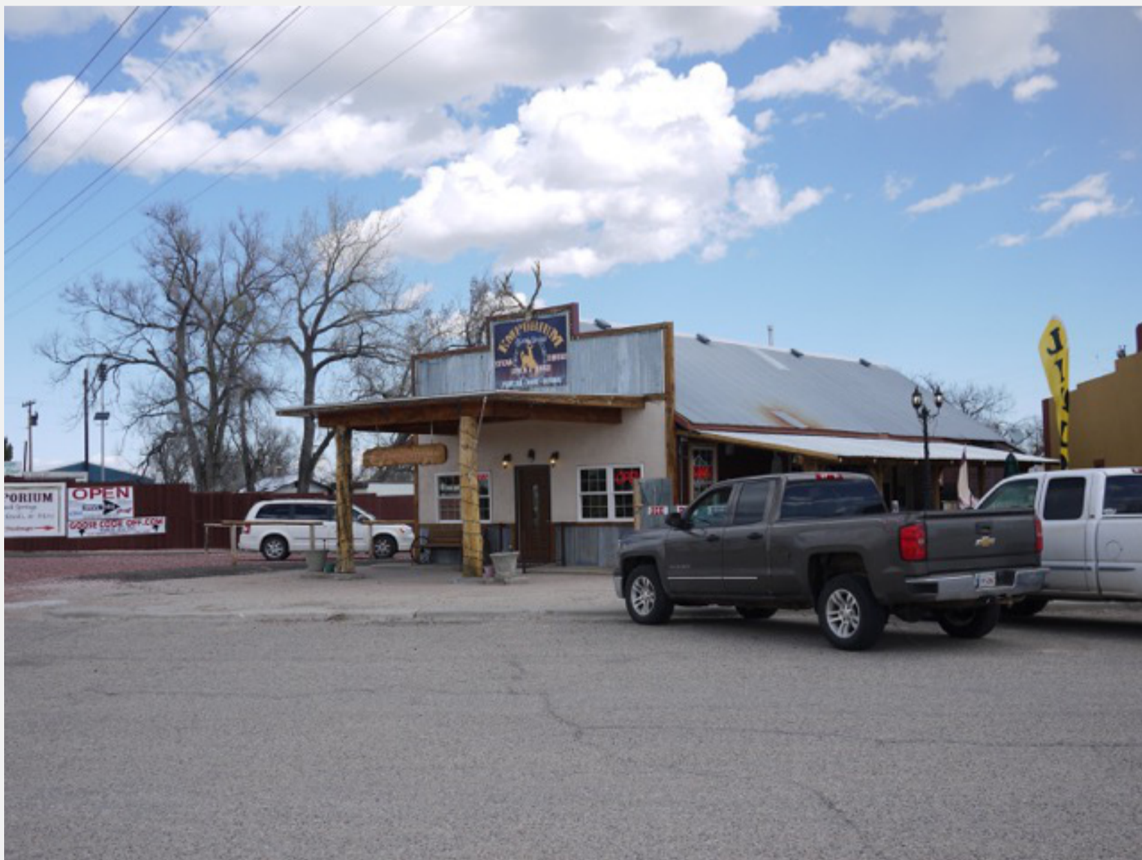
The Emporium, Hawk Springs.