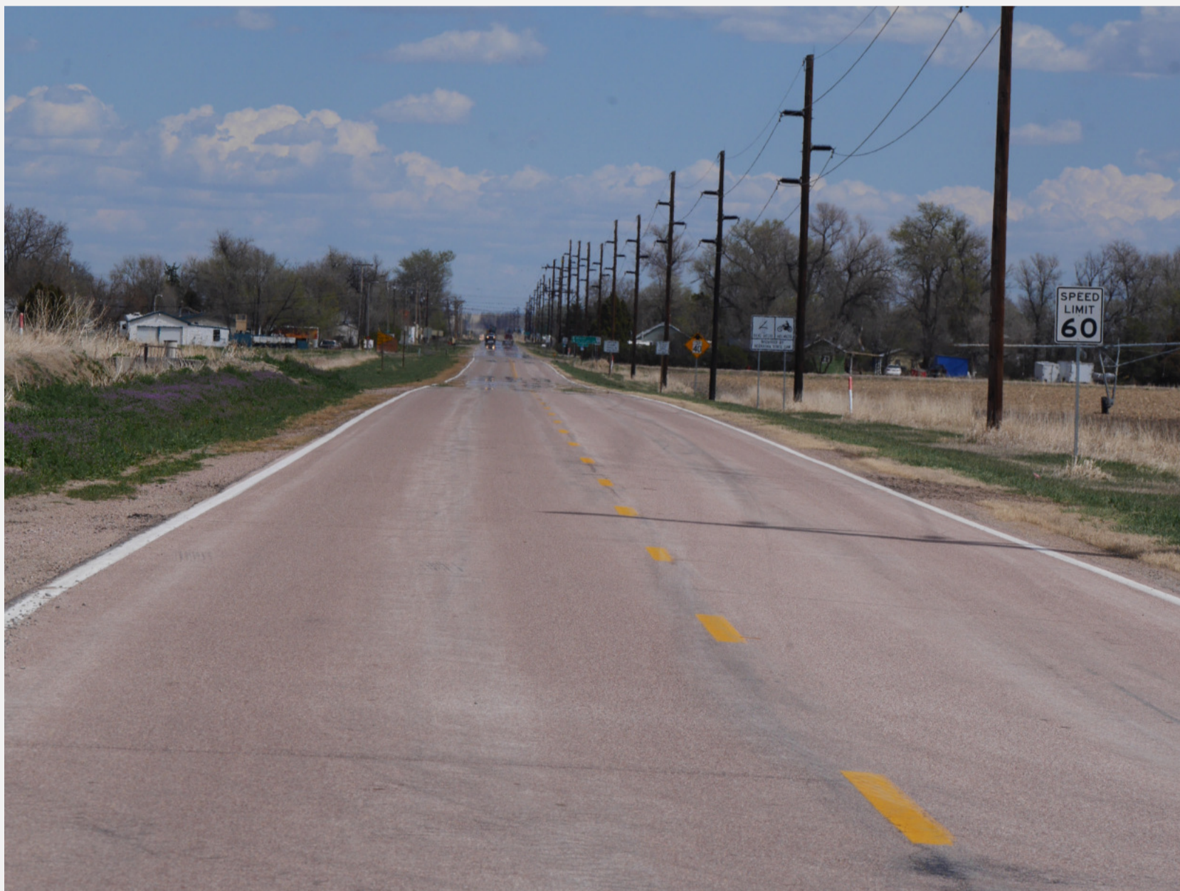
Border country. Highway into Lyman from Wyoming.

Looking across the state line, signs remind travellers from Wyoming that seat belts and motorcycle helmets are required by Nebraska State Law. A 40mph speed limit slows traffic heading into Lyman. Trucks shimmer in the heat haze and purple flowers line the roadside. In the opposite direction, Wyoming's bronco and mountains beckon along the only manicured stretch of grass that I'll see for an hour or two. A row of Cottonwoods intersect with the highway to reveal a creek.