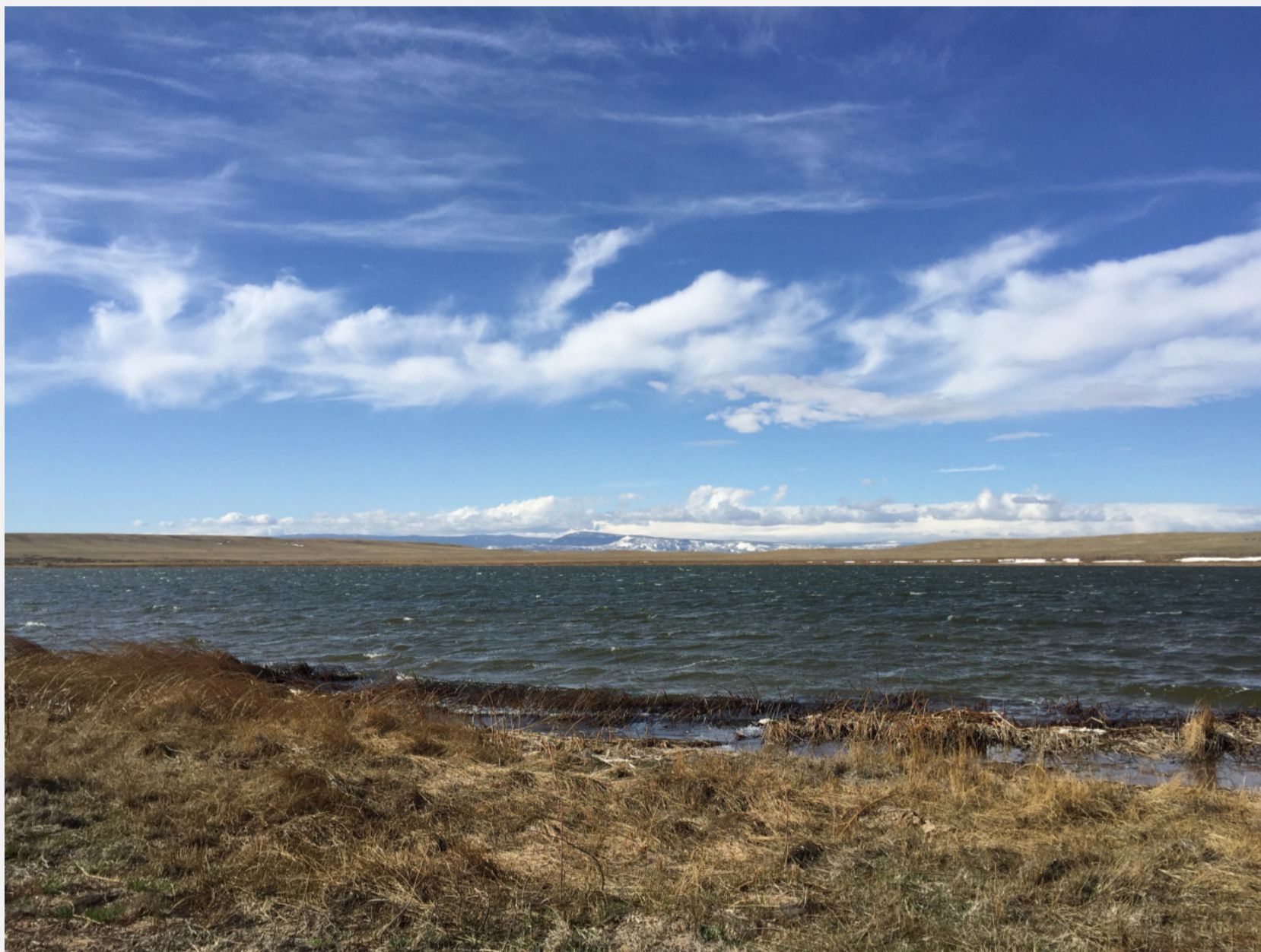
Hutton Lakes, 9 April 2016. My photograph.

And Lenin has lived and Jehovah died: while the mother-eagle Hunts her same hills, crying the same beautiful and lonely cry and is never tired; dreams the same dreams, And hears at night the rock-slides rattle and thunder in the throats of these living mountains. Robinson Jeffers, " The Beaks of Eagles ."