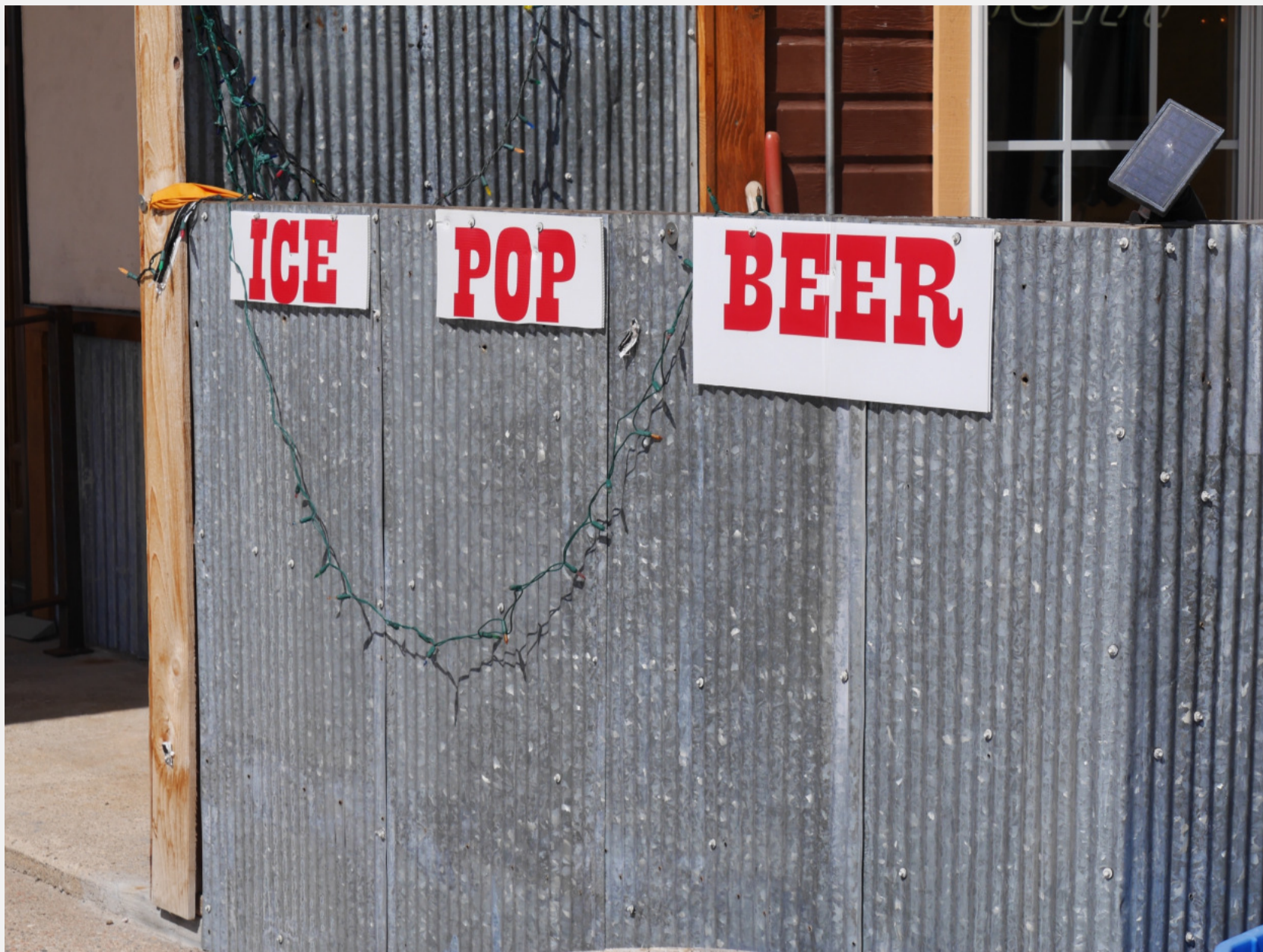
Refreshments at The Emporium, Hawk Springs.

advertising a goose cook-off. I heartily recommend it and will definitely call there on another visit. The bar was decorated with snowshoes and stuffed animals, along with University of Wyoming sports memorabilia. Outside, wooden posts supporting what today was a rather hot tin roof over a small terrace serve as a guest book. The Emporium is a gem. The staff make you feel like locals. You'll leave with a smile, feeling good about the world.