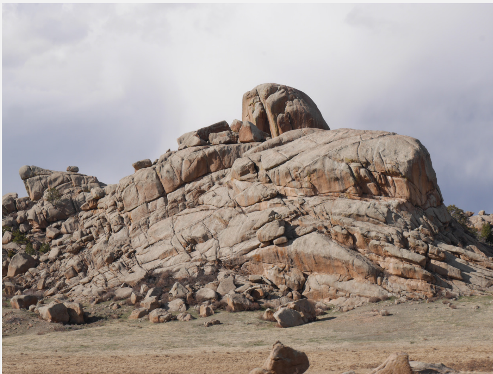
Near Vedauwoo National Park, Wyoming. My photograph.

Well, I'm told that seeing the sandhill crane migration is unforgettable. I'll try again next year. As I close this post, I'm thinking of some lines from Wordsworth about the value of what happens when the anticipated experience doesn't materialise. In The Prelude , Wordsworth remembers a boy (most likely himself) who "blew mimic hootings to the silent owls" (5:398. 1805 Prelude ). Many of us have had that experience: in the boy's case the owls then reply, bringing a rush of exhilaration and joy. But Wordsworth also recalls "a gentle shock of mild surprise" (5:407) in moments waiting, when there has been a long and unexpected silence. At first the boy feels mocked. It's as if he has failed. He is crestfallen. The shock is brought about not by disappointment, however, but by something that both restores confidence and is invigoratingly new: for his mind has been made more receptive to the unexpected. He heard, or imagines that he heard, a sound that "carried far into his heart / The voice of mountain torrents." The poem continues with the activation of other senses: "the visual scene / Would enter unawares into his mind" (5: 406-10). This day excursion through a country I'd not been able to anticipate, because I was thinking with expectation about the sandhill cranes, has been one that I'll remember, for so many reasons other than the absent birds. I'm left with the memories that I've tried to share here, along with the anticipation of cranes on another day.