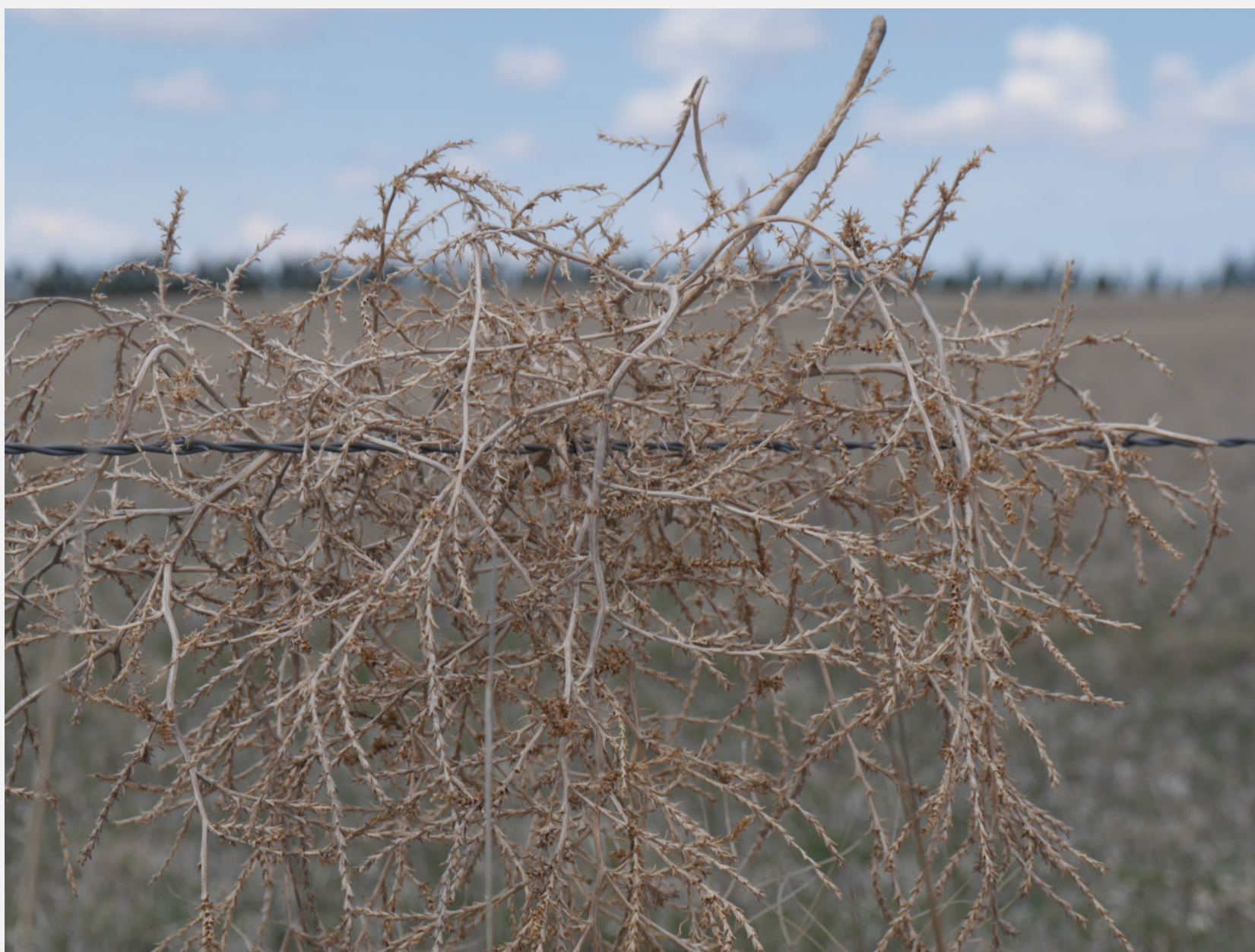
Tumbleweed and barbed wire.