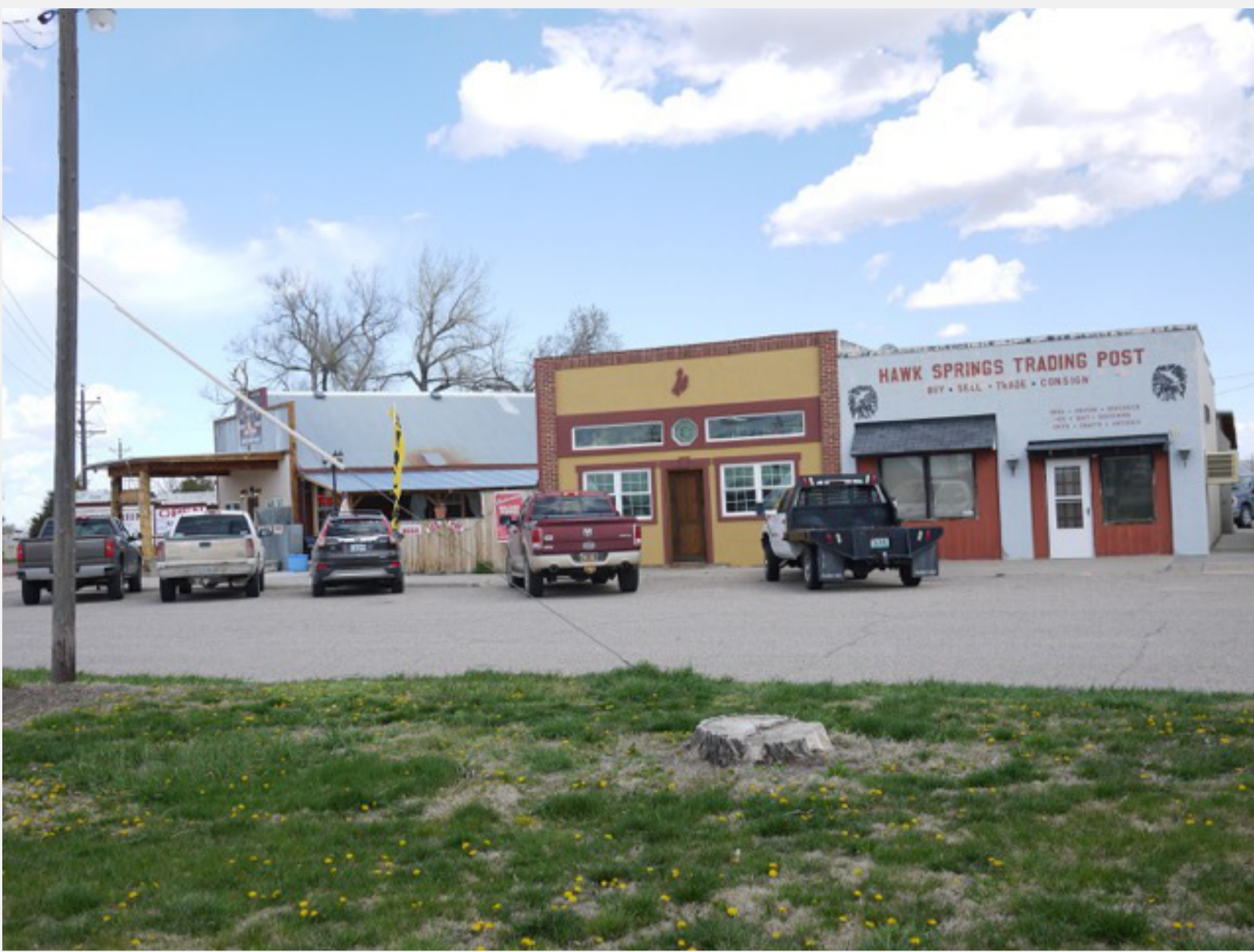
Hawk Springs trading post on Highway 85, Wyoming. My photograph.

My return to Laramie along Happy Jack Road from Cheyenne returns a familiar landscape of ridges and boulders. It's late afternoon. Pronghorn are feeding not far from the highway, near some horses. Like sandhill cranes, pronghorn migrate (see articles by members of the Haub Environmental School, University of Wyoming, in High Country News ). Barbed wire is one of the hazards they encounter.