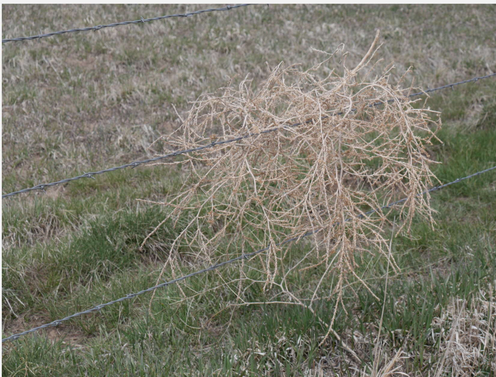
Tumbleweed and barbed wire 2. My photograph.