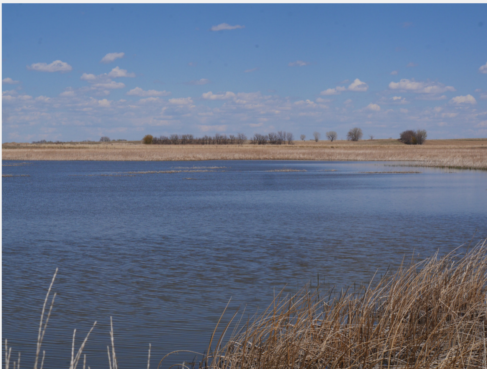
Marsh without cranes, Goshen North Platte lower wetlands wildlife complex.

Well, it would be a lie to say that I wasn't disappointed. An evening engagement in Laramie meant there wasn't time on this visit to travel much further. But you don't have to try all that hard to look beyond the sandhill cranes to see the beauty and dignity of this grasslands and ranch border country with Nebraska. I drove for several miles through an area farmed with arable crops, grass for hay, and cattle.