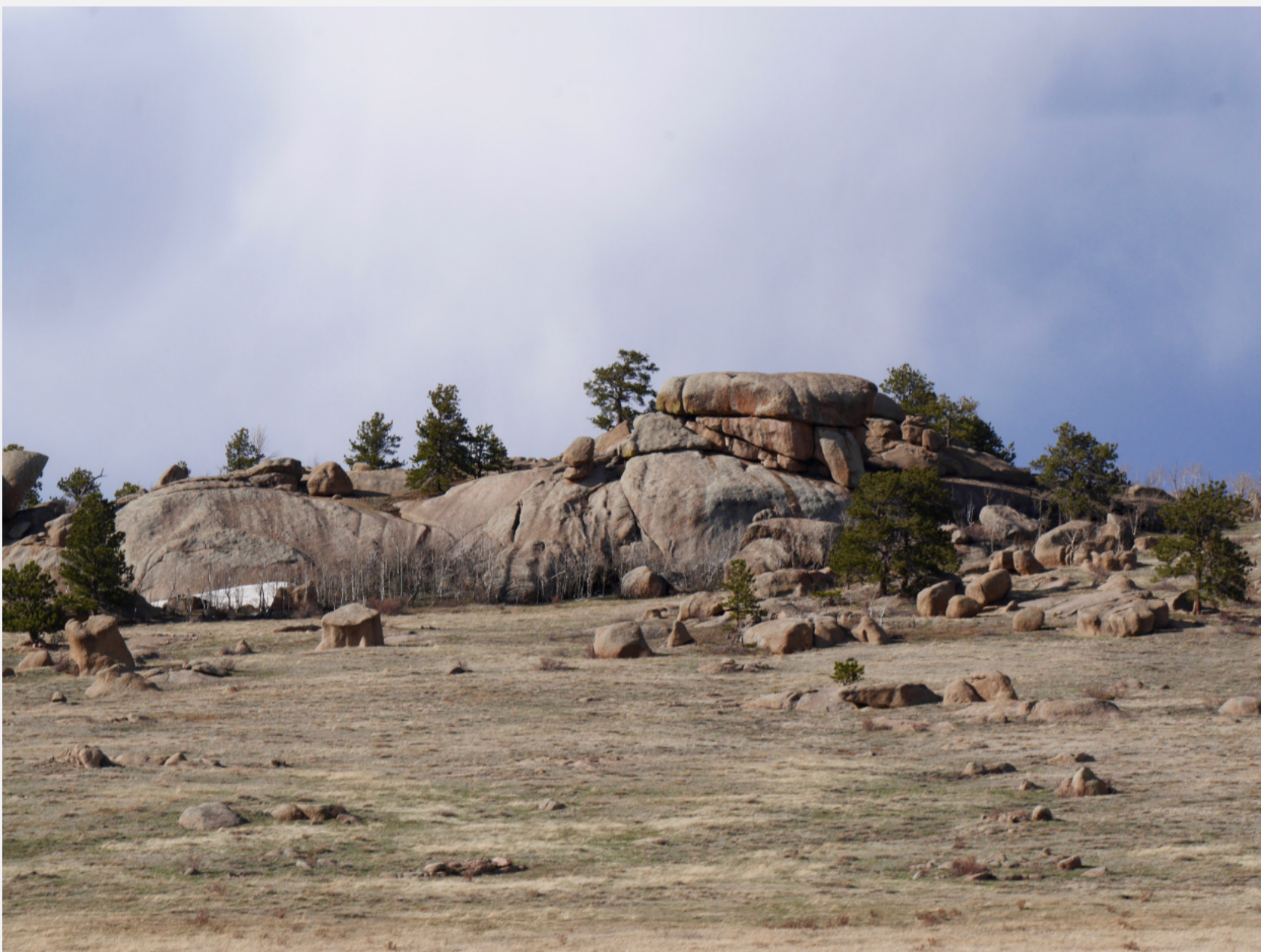
Near Curt Gowdy State Park, Wyoming.