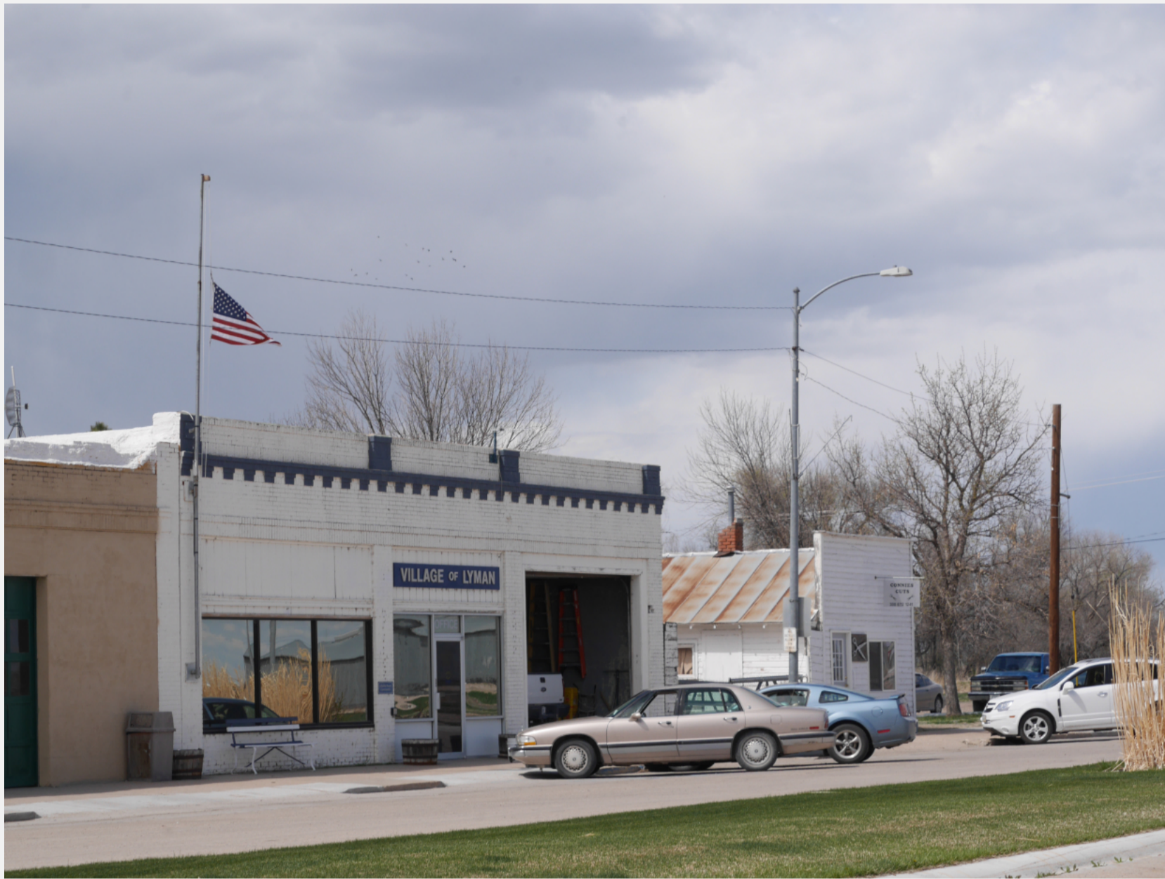
Main Street, Lyman, Nebraska. My photograph.

census. Main street includes a library, a barber's shop and a post office.