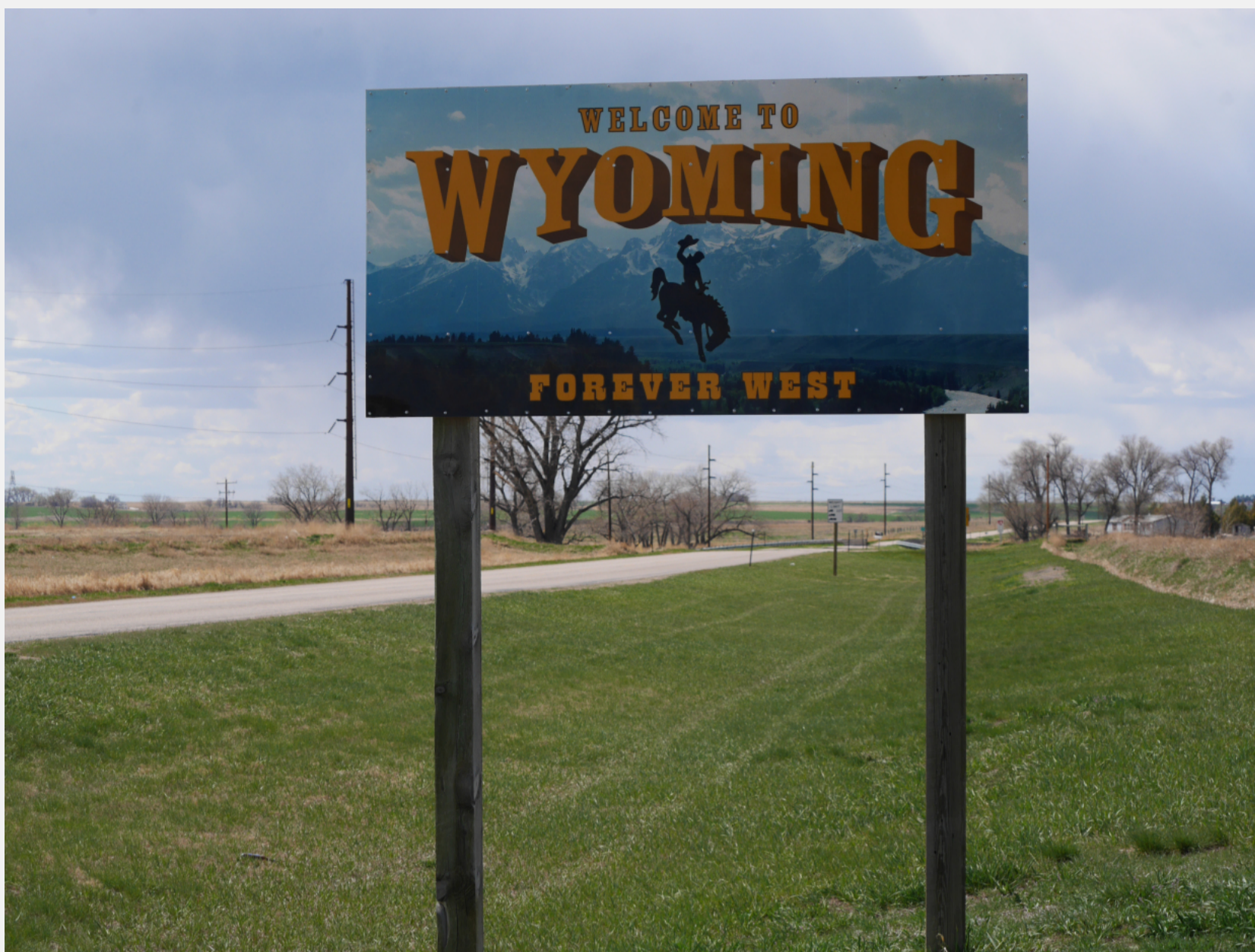
State line, Wyoming.

The friend who'd given me the route for this wild crane chase also mentioned some ponds with waterfowl close to the highway. I saw several ring-necked ducks, cinnamon teal and couple of pairs of shovelers along with mallard, coot and Canada geese. Returning to Highway 85 and heading south took me back though more ranch country. On the way up, there'd been wild turkeys along the verge. Now barns gleamed white against the earthy pastel green and ochre of the Wyoming grasslands.