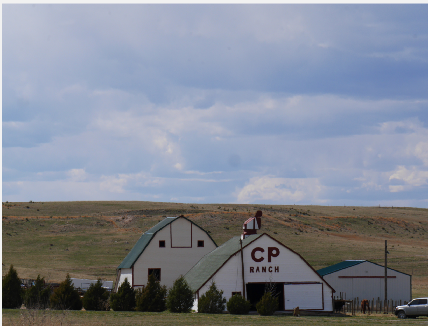
Ranch with barns along highway 85, Wyoming.

The friend who'd given me the route for this wild crane chase also mentioned some ponds with waterfowl close to the highway. I saw several ring-necked ducks, cinnamon teal and couple of pairs of shovelers along with mallard, coot and Canada geese. Returning to Highway 85 and heading south took me back though more ranch country. On the way up, there'd been wild turkeys along the verge. Now barns gleamed white against the earthy pastel green and ochre of the Wyoming grasslands.