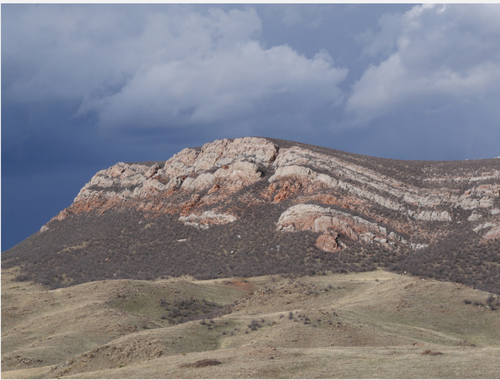
Geology and weather: ridge with storm clouds between Cheyenne and Laramie.