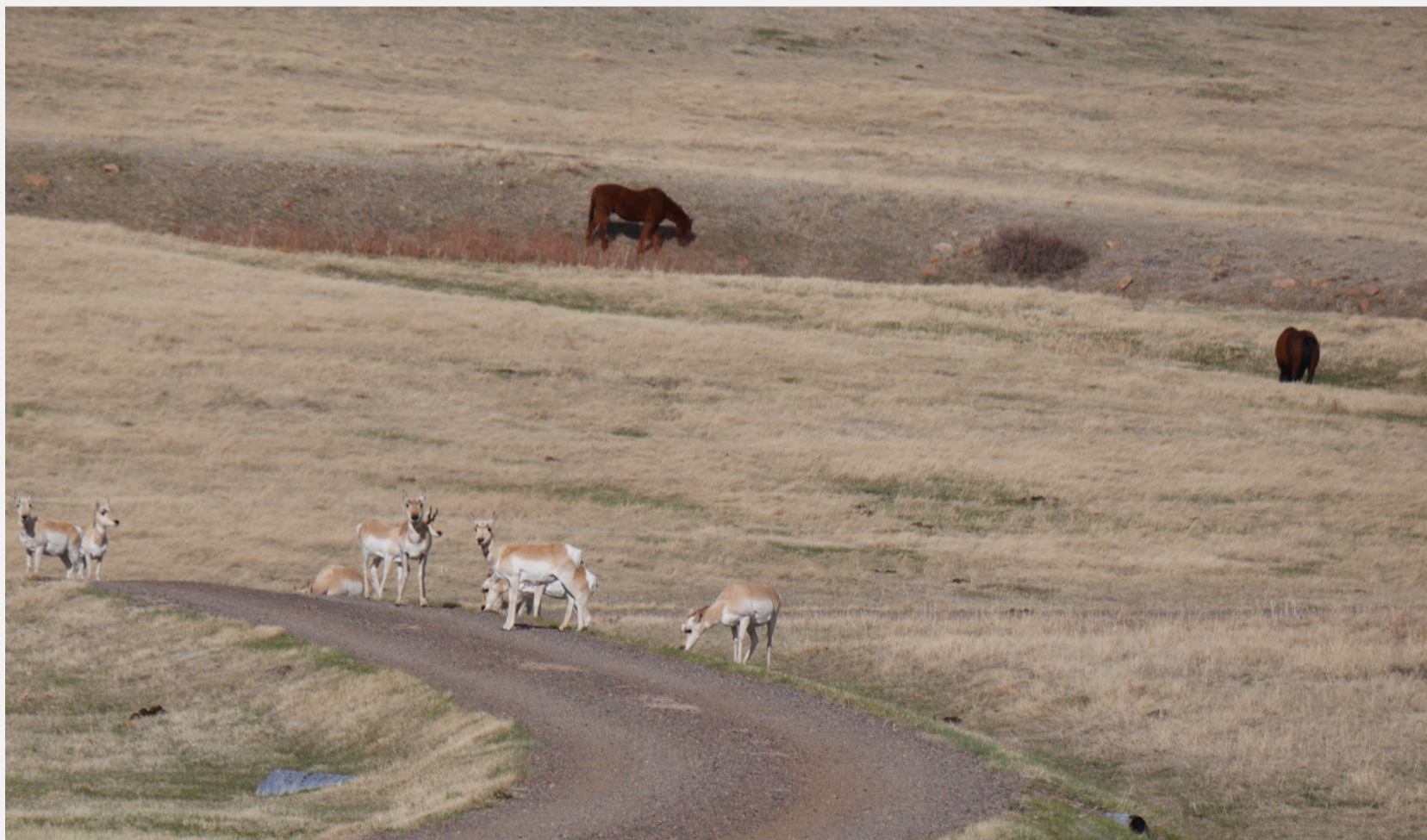
Pronghorn with horses, near Cheyenne.

My return to Laramie along Happy Jack Road from Cheyenne returns a familiar landscape of ridges and boulders. It's late afternoon. Pronghorn are feeding not far from the highway, near some horses. Like sandhill cranes, pronghorn migrate (see articles by members of the Haub Environmental School, University of Wyoming, in High Country News ). Barbed wire is one of the hazards they encounter.