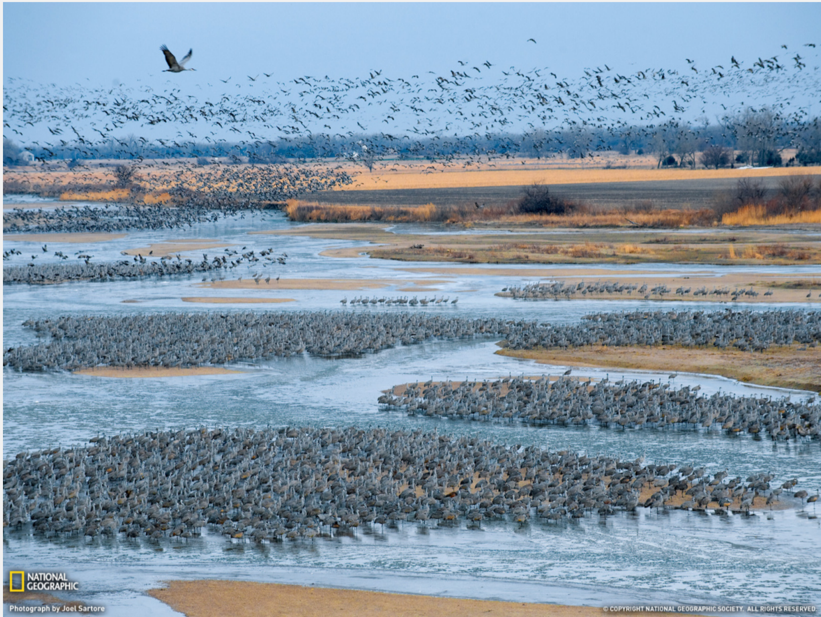
Sandhill cranes on the Platte River, Nebraska. National Geographic wallpaper