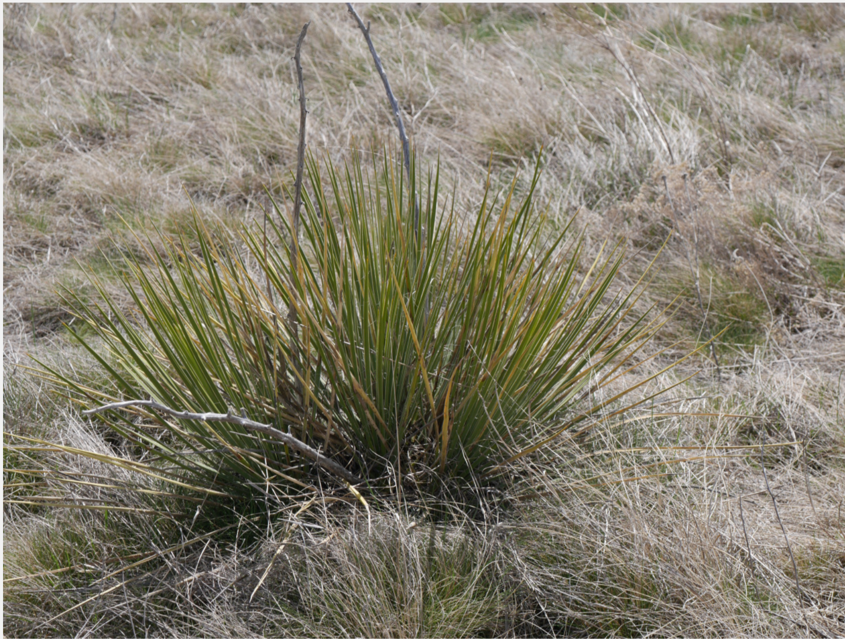
Soapweed Yucca ( yucca glauca ). My photograph.

As the land through which I pass becomes drier, there there's an increase in the population of soapweed yucca ( yucca glauca ). Common and, like the tumbleweed, considered an invasive nuisance, this most widely distributed of North America's yuccas is nevertheless listed as an imperilled species in Missouri. The crushed roots lather when mixed with water and can be used as a natural shampoo.