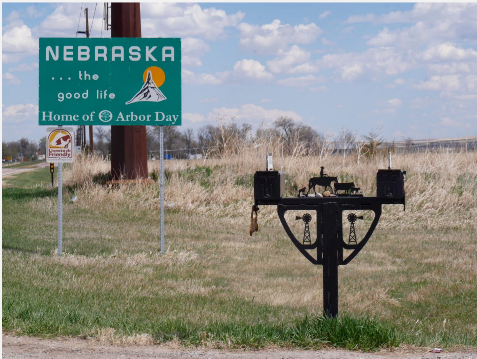
Nebraska state line.

A sense of time lies thick and heavy on such a place . . . . The cranes stand, as it were, upon the sodden pages of their own history.