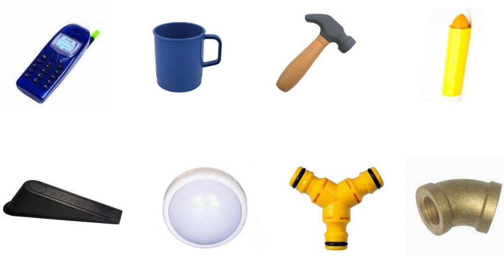
Figure 1. The eight objects used in Experiments 1 and 2. The familiar objects were a phone, a cup, a hammer and a crayon. The unfamiliar objects were a doorstop, a touch-light, a hose part, and a plumbing part.