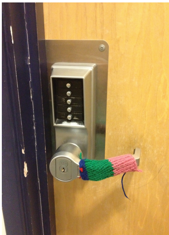
Figure 4 and 5. Post room door handle