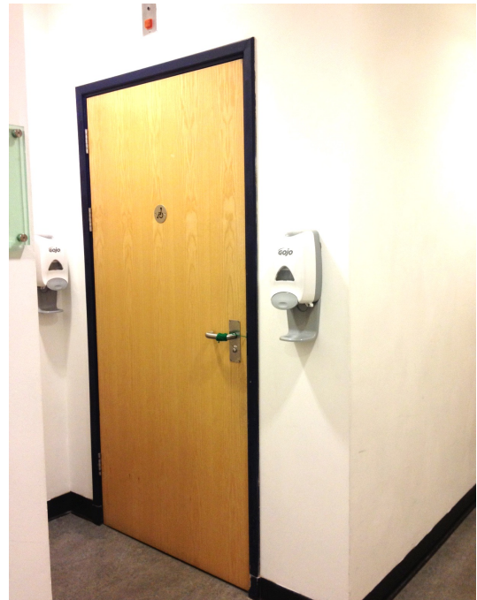
Figure 3. Restroom door handle