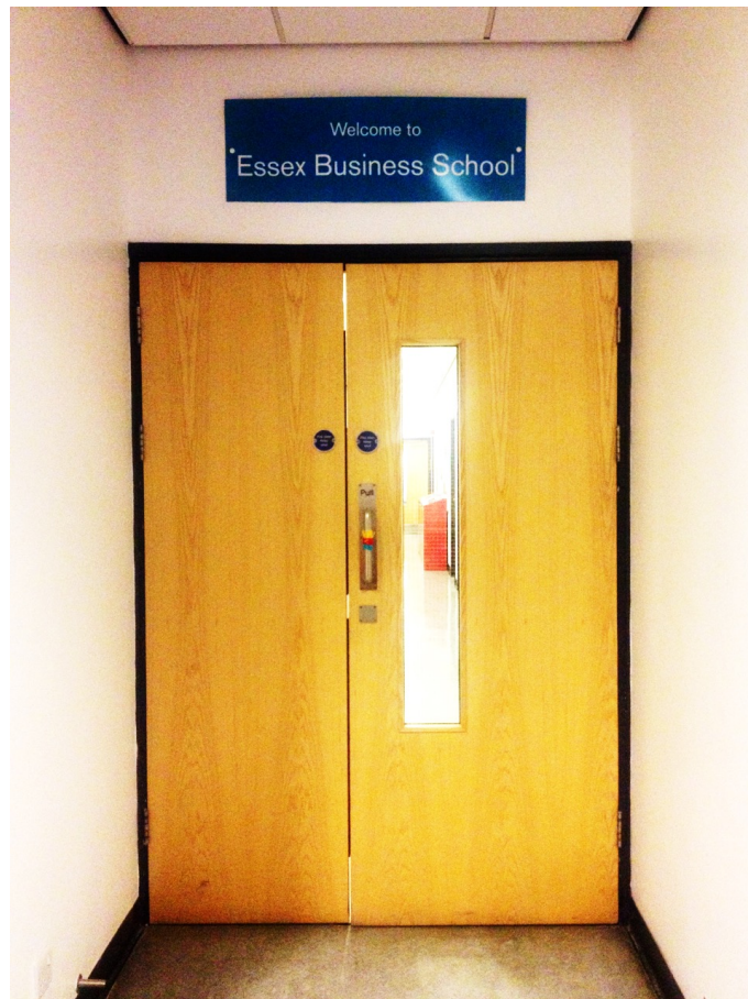
Figure 1. Business School entrance, with a small colourful piece of knitting on the door handle

Essex Business School, The University of Essex