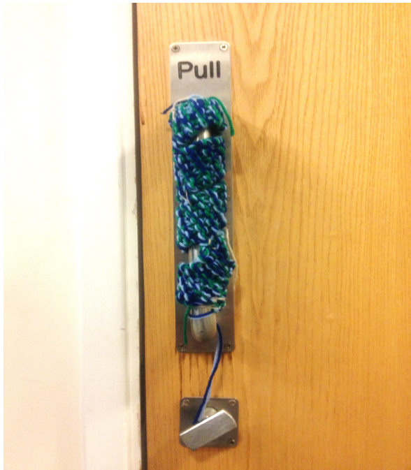
Figure 2. Women's restroom door handle