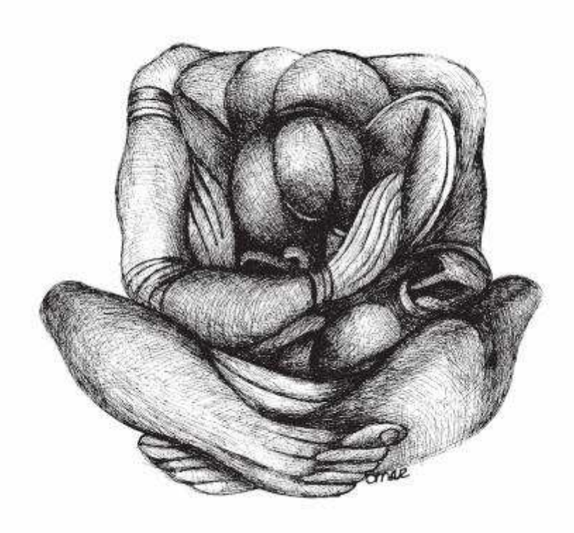
Single Man. Credit:

Torture is a calculated act of cruelty and brutality that degrades us all and weakens the rule of law. On International Day in Support of Victims of Torture, let's eradicate complicity with torture.