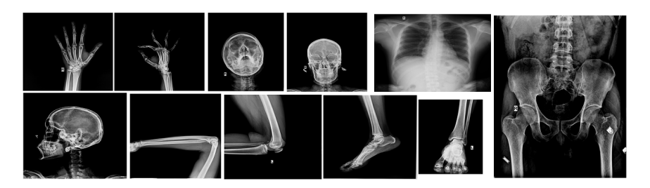
Fig. 3: Example images from the training data set.

Objective and Task for the 2015 Edition The primary objective of this task is to group digital x-ray images into four major clusters: head-neck, upper-limb, body, and lower-limb. The secondary goal of this task is to partition the initial clusters into sub-clusters, for example the upper-limb cluster can be farther divided into: Clavicle, Scapula, Humerus, Radius, Ulna, and Hand. However, due to the time constraint and difficulty level of the task, this year we decided to go only with the primary objective.