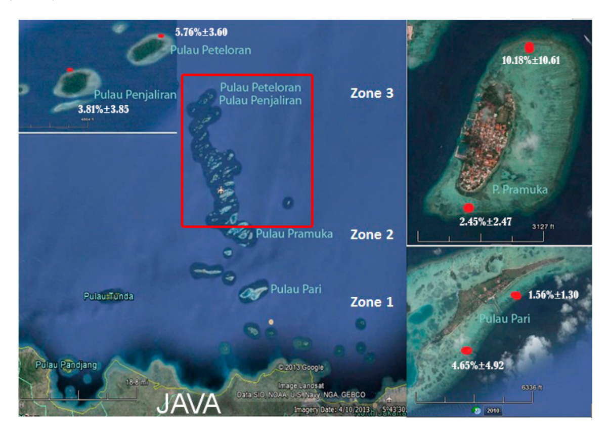
Figure 1. Maps showing the locations of each zone monitored in this study. Zone 1 = nearest sites (Southern Pari and Eastern Pari islands) with a population of 2458. Zone 2 = middle sites (Southern Pramuka and Northern Pramuka islands) with a population of 5123. Zone 3 = farthest sites (Penjaliran and Peteloran islands) as core zone of marine park which no population. The red squares represent the core zone of the Marine National Park area and the red points represent the six study sites with prevalence average of all sampling times of BBD.

The prevalence and incidence of BBD were monitored at reef sites belonging to three different islands in Kepalauan Seribu, an archipelago located near the densely populated island of Java. Island selection (Figure 1) was based on distance from the mainland ( i.e. , Java). Two islands; Southern Pari (05°52′14.0″ S, 106°36′38.8″ E) and Eastern Pari (05°51′30.5″ S, 106°37′25.9″ E) represented the nearest sites (Zone 1, 17.99 km from Java), Southern Pramuka (05°45′01.9″ S, 106°36′41.5″ E) and Northern Pramuka (5°44′24.9″ S, 106°37′14.5″ E) represented the middle sites (Zone 2, 31.70 km from Java), and Peteloran (05°27′07.6″ S, 106°33′44.9″ E) and Penjaliran Timur (05°27′34.0″ S, 106°33′49.3″ E) represented the farthest sites (Zone 3, 63.65 km from Java). Pari Island and Pramuka Island are inhabited, while Peteloran and Penjaliran Timur are within the core zone of the uninhabited National Marine Park (and thus assumed to be an area less exposed to sources of anthropogenic pollution). It should also be noted that fish farming is undertaken to a large extent around Pramuka Island (Zone 2).