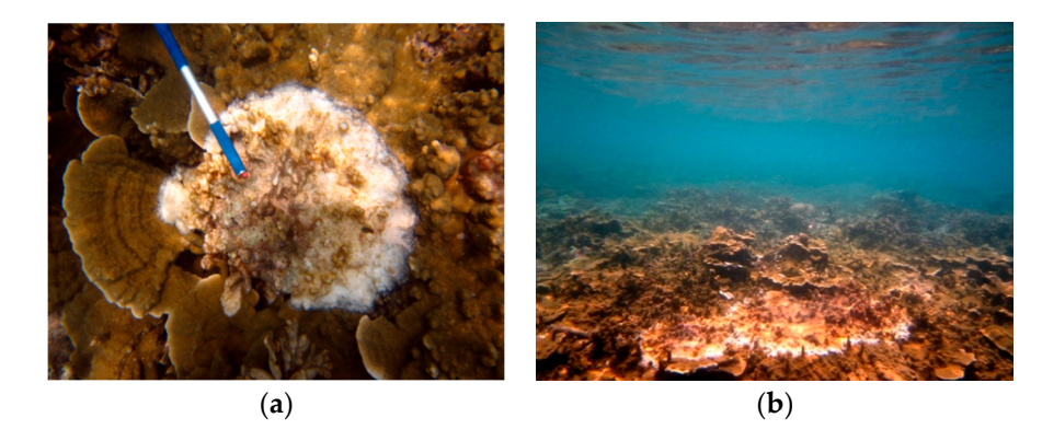
Figure 2. (a) Representative image of Montipora sp. showing signs of BBD, which often started in the centre of the colonies; (b) the majority of colonies showing signs of BBD were found in shallow waters (less than 2 m depth).