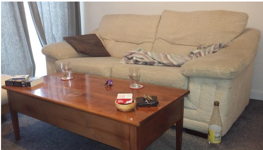
Figure 4. Photograph accompanying the acquaintance rape scenario in Study 3.

Materials and procedure. Participants first read the same scenario employed in Study 1, and examined a crime scene photo depicting a sofa, a table, and other neutral objects (see Figure 4).