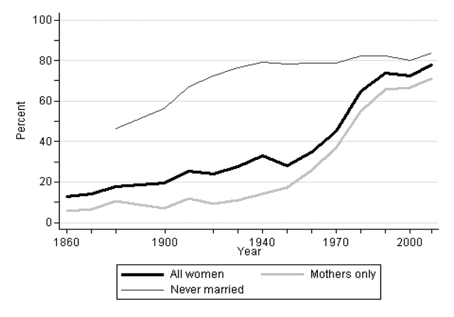
Fig. 1.—Female employment rate, women aged 25–34. Sources: IPUMS census 1860–2000, 2009 ACS sample. See the appendix for a description of the data and variables used. Color version available as an online enhancement.

tributes, we analyze how the arrival of equal opportunities radically transformed female match incentives in the marriage market. Our focus is motivated by figures 1 and 2, which describe the large change in female economic outcomes in the United States following the 1950s. Figure 1 shows the employment rates of women aged 25–34. Single (never-married) women in this age group have always had relatively high labor market participation rates (around 80 percent since 1940). But for this same age group, the labor market participation rates of women with children dramatically increased following the early 1950s. With household production increasingly sustained by new labor-saving appliances, children safely at school, and a doubling of real wages from the mid-1930s to 1960, mothers had an ever-increasing incentive to switch more of their time to the booming labor market (Greenwood, Seshadri, and Vandenbroucke 2005; Greenwood, Seshadri, and Yorukoglu 2005). But prior to the 1964 Civil Rights Act, "marriage bars" were commonly used in professions such as doctors, lawyers, teachers, and clerks to restrict the employment prospects of married women (see Kessler-Harris 1982, 2001; Goldin 1990, 1991). These marriage bars had real bite: of those married women who were labor market participants in 1920, only 10 percent were employed as teachers or clerical workers. By 1970 that statistic had risen to 40 percent (Goldin 1991).