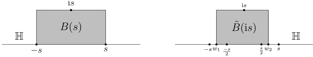
Figure 4.2: The Boxes B(s) and \tilde{B}(is) .

In [25] it is shown that B(is) can be shifted to a nearby box \tilde{B}(is) with some nice properties. To outline these properties let the boundary of \tilde{B}(is) on the upper half plane be \Upsilon which consists of line segment from w_1 + is to w_2 + is and line segments from w_1 + is to w_1 and w_2 + is to w_2 for some -s < w_1 < -s/2 and s/2 < w_2 < s (see Figure 4.2).