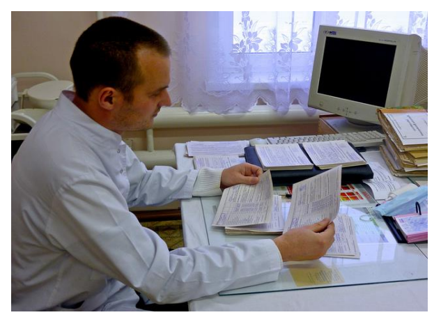
Dimitry Kirillov/World Bank

Assessing risk is done by evaluating key characteristics or variables in data files that are the most risky for leading to participant identification in a specific project. These can be direct identifiers (e.g. a person's name, picture or detailed geographic location), indirect identifiers (e.g. extreme household size, specialised profession, unusual health conditions), or a combination of various characteristics that jointly result in disclosure. Disclosure risk analysis can involve running frequency analyses of variables to determine low-frequency responses and extreme outliers. This needs to be complemented by qualitative analysis of risk characteristics based on local knowledge of field work, its design and the