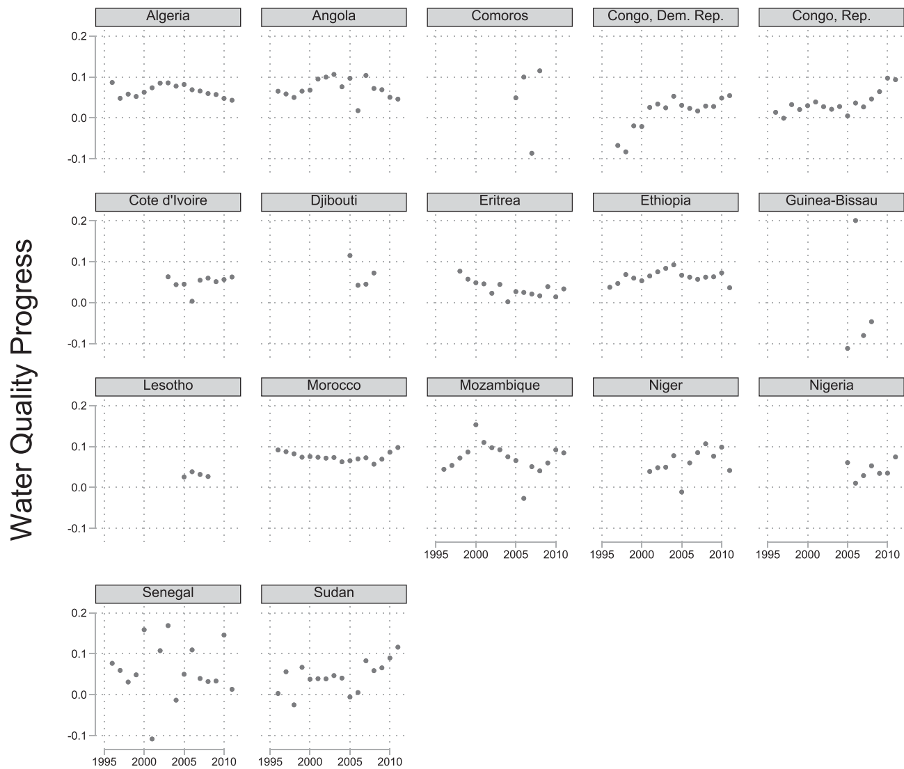
Figure 1 Environmental quality–water quality progress.

Note: Graph shows distribution of outcome variable for all countries and years in our sample.