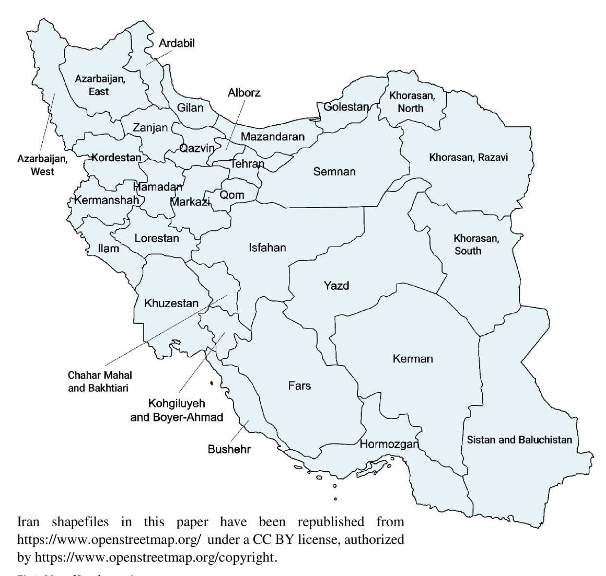
Fig 1. Map of Iran by province.

To analyse geographical inequalities, we estimated age-standardised breast cancer incidence and mortality for the 31 provinces (Fig 1) and three time intervals: 2000–2003, 2004–2007 and 2008–2010. We used the mean national rate for Iran in 2010 in each age group and then multiplied by the population in each province-age group to estimate the expected incidence and deaths. In this study, we applied a Bayesian Poisson spatial model using covariates, which prevented unbalanced estimates and gave proper results in each province. Spatial modelling