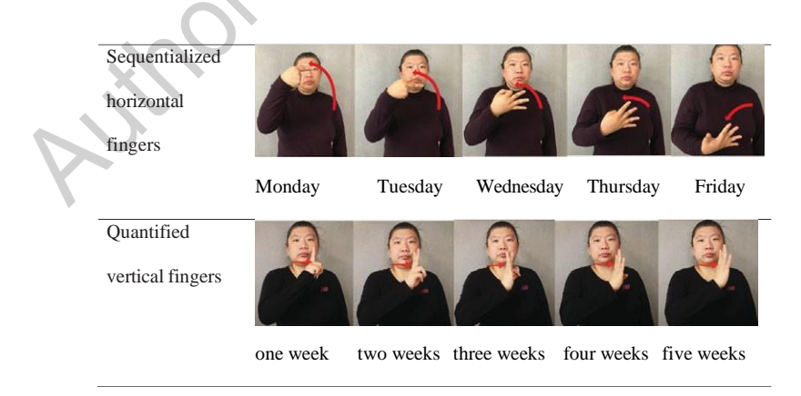
Fig. 4. Comparison of numeral incorporations of sequentialized horizontal and quantified vertical fingers.

We used the abbreviation F to stand for finger(s) and 1, 2, 3, 4, and 5 to code the thumb, index finger, middle finger, ring finger, and little finger, respectively. For example, F12 means that the thumb and index finger were extended. Furthermore, for digital and numeral incorporation (but not for points-to-fingers), we differentiated two types of placements of fingers to distinguish their directional difference: normal finger-number representation with fingers extended vertically, which was coded as 'VF', and horizontal fingers that denoted ordinal numbers in CSL, which was coded as 'HF'. For example, HF12 means that the thumb and index finger were placed horizontally. As for points-to-fingers, we used a circle over the relevant number to denote the finger being pointed at. For example, F(1)2 means that the