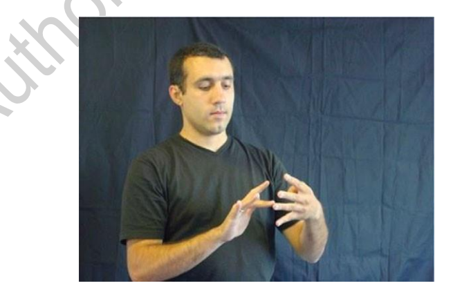
Fig. 3. A specific day in the third week (Pereiro & Soneira, 2004).

According to a survey, Wang (2009) roughly identified points-to-fingers temporal signs in CSL for the first time, which were glossed in Mandarin as "第一" 'the first', "首先" 'at first', "其次" 'secondly', and "再次" 'thirdly'. However, all the data collected by Wang were elicited from written orthography. It is still not clear how signers use these forms in their natural daily conversation, and what their function,