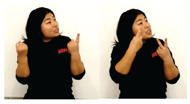
Fig. 2. Sequentially built list buoys

picture it refers to the third week of a month). They argue that such a representation is both iconic and regular, and can be regarded as a classifier. However, the configuration of the right hand is not typical pointing (using the middle rather than the index finger), and the form itself has the meaning of 'a specific day'. Given that the authors give only a sporadic description using one example, it is unclear as to how systematic such a representation can be.