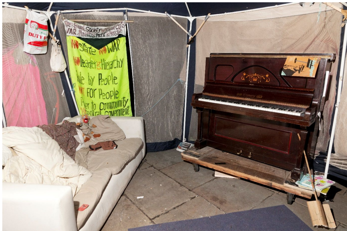
Figure 1. No Leader – Encampment Tent