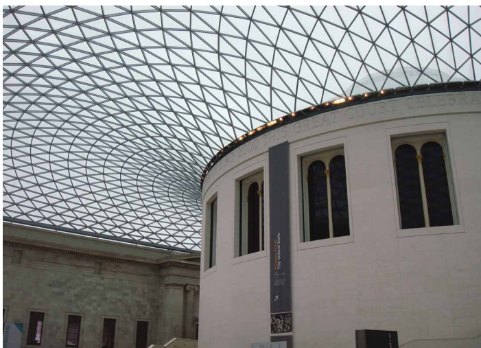
Figure 4 Great Court