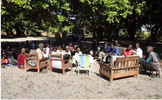
Members from the Mweke Craft Centre