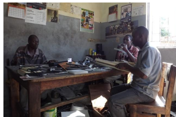
Mooka Leather Crafts workshop

Mumwa works in partnership with some local craft enterprises helping them to market and sell their products. Products from these affiliated businesses are also sold in the Mumwa craft store in Mongu. An example of this is Mooka Leather Crafts a separate business run by a member of the Mumwa Crafts Association. Mooka Leather Crafts is a small business employing approximately 8 workers. It produces a variety of leather products including shoes, belts and key rings; it also makes natural fibre bible covers and document holders. Approximately 75% of Mooka’s products are sold through the Mumwa Craft Association. Mumwa also purchases crafts from other groups in Western Zambia on a more ad hoc basis.