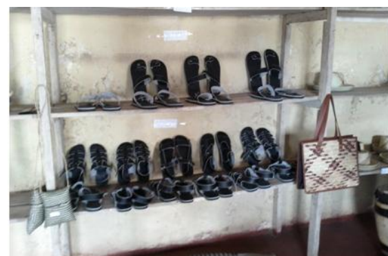
Mooka leather products on display in the Mumwa Craft Store