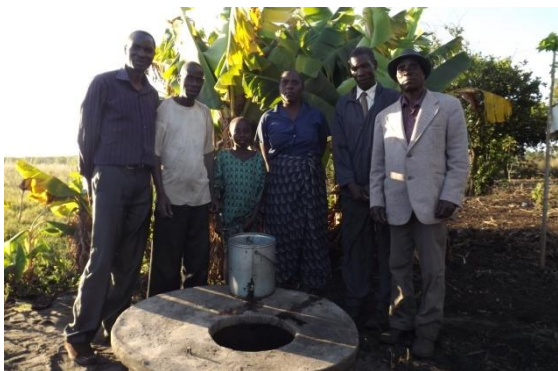
Type 1 well constructed by Mumwa and the Zambian Government

Constructing Rural Water Wells - Access to safe drinking water is a major problem for many of the communities Mumwa works with. In the rainy season water may be polluted, in the dry season water is often scarce. The Mumwa Crafts Association has constructed over 26 wells in local communities, including some funded as part of a Zambian government programme. This has helped to address the aforementioned problems and also assists already overburdened women saving them time and reducing distances travelled to collect water. The creation of these wells has also helped reduce instances of water borne diseases and those associated with poor sanitary conditions.