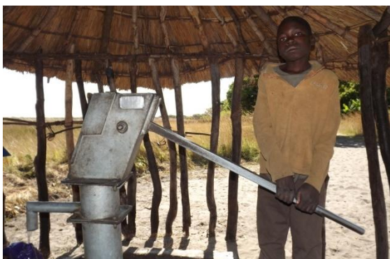
Type 2 pump well constructed by Mumwa

Afforestation and training in sustainable natural resource use - Zambia's Western Province is rich in natural resources and