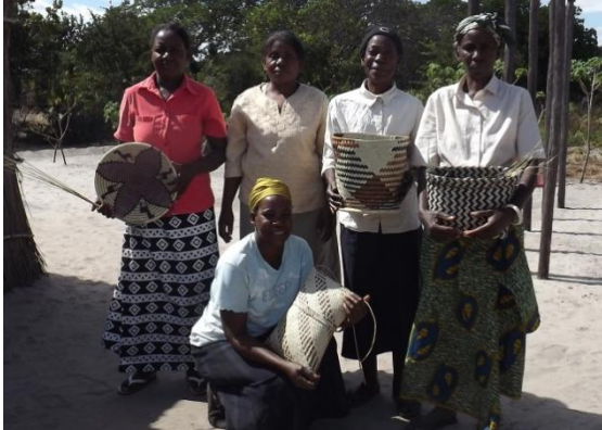
Members from the Kavula Craft Centre