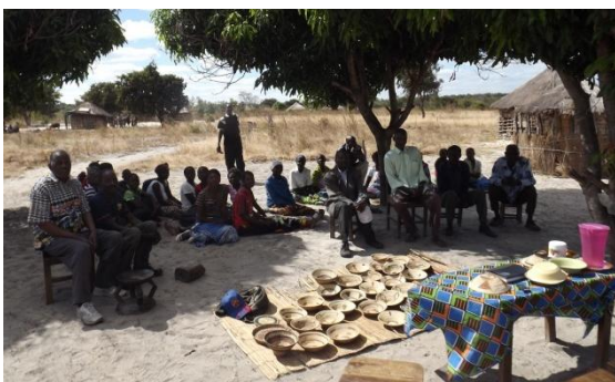
Members from the Lububa Craft Centre

If Mumwa receives a large order with a rapid turnaround, or an order for export requiring stricter quality control monitoring, it may require members to