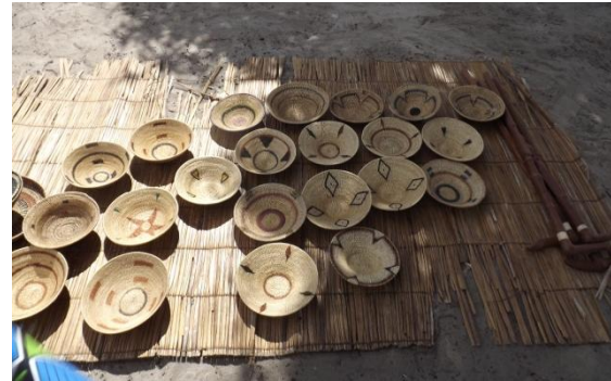
A selection of natural fibre bowls

use; and various kinds of jewellery and trinkets.