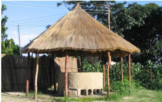
Biomass energy stove

Biomass Energy Project - In collaboration with GTZ Mumwa has established a biomass energy project. This project is operational in a number of villages and involves the use of improved clay stoves that consume less firewood and which can use other renewable fuels which are less environmentally damaging.