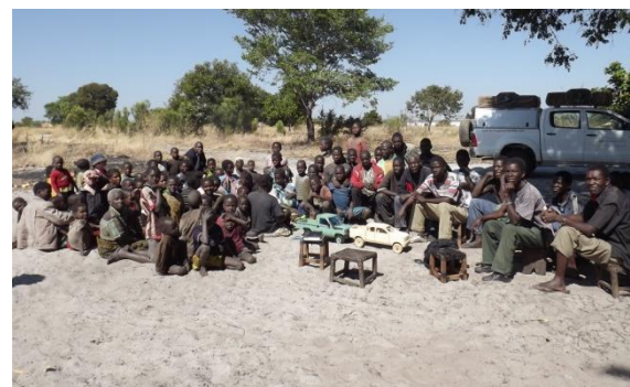
Members from the Toy Project Craft Centre

Craft production is centred on Mumwa's community centres. When Mumwa receives an order the management team liaises and coordinates with committee members for the different community centres to ensure that it is fulfilled. Individual community centre members also produce crafts on a more ongoing basis. These products are assessed by local committee members who give them a quality grading. Mumwa then purchases these products for sale, with specific dates each month established for purchasing and collection. In some instances when Mumwa is short on capital, craft products may be purchased without up-front payment. When the product is sold producers then receive their money. Non-members also sometimes contribute to craft production at some community craft centres.