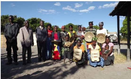
Members from the Makapila Craft Centre