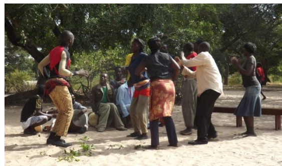
Drama performance by the Mabumbu Youth Group

members and wider communities. The Association also supports HIV/AIDS education and awareness campaigns. Mumwa regards HIV/AIDS as a key cross cutting issue which should be addressed as part of its approach towards community development and poverty alleviation. From an operational perspective HIV/AIDS has the potential to seriously impact on its activities. Mumwa has sought to mainstream HIV/AIDS within the organisation. It has been involved in training peer educators, has supported community drama groups, has helped establish Anti-AIDs Clubs, and has undertaken community sensitisation and education. Mumwa also works with partner organisations and local service providers to tackle wider health issues across Western Province. An example of this is its interventions in Mabumbu village where it has funded the construction of a dedicated space for mother and child health services increasing the capacity of the local health centre. The Mabumbu Youth Group an affiliate organisation is also based at the centre and undertakes health related drama performances and interventions in local communities engaging with issues of HIV/AIDS but also talking about subjects like malaria, sanitation, and wider social issues.