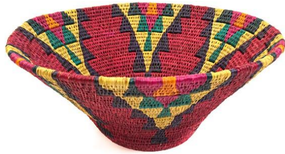
Swazi Lutindzi Basket