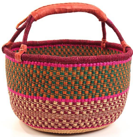
Ghanaian Bolga Basket from Baskets of Africa.com