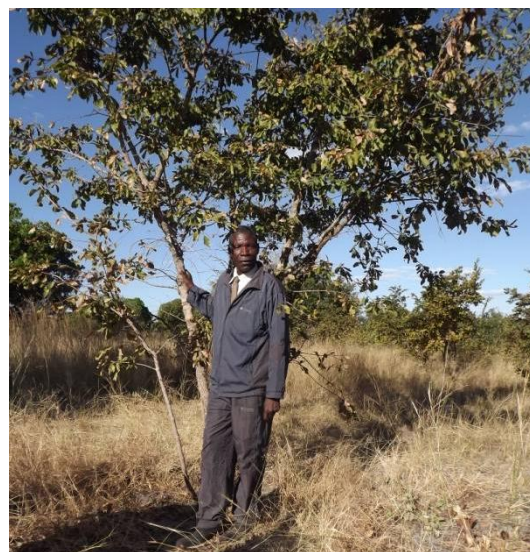
Makenge Tree Afforestation

the raw materials required for craft production. However there is a danger of these natural resources being degraded or even exhausted if they are not managed sustainably. The Mumwa Crafts Association recognises that with proper sustainable management these natural resources can be an asset not just for current but also future generations. Access to natural resources and the sustainable management of those resources is a key part of having a successful craft industry. To this end the Mumwa Craft Association has engaged in tree planting schemes and has also undertaken educational awareness campaigns on sustainable natural resource management running workshops and holding meetings with local communities. Through these campaigns over 6000 people have been reached and over 11 hectares of indigenous tree species have been planted. These trees have become an additional source of income and livelihood for communities, who now use them for carving and to extract nuts and oil.