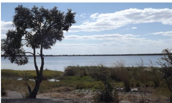
A Lake stocked with fish by Mumwa

Fish stocking - Mumwa recognises that fishing has the potential to provide additional income and alternative livelihoods for many of its members and their households. To encourage the development of these livelihood activities Mumwa has begun to stock existing lagoons and lakes across the region with fish, and in some instances has sought to develop fishing ponds.