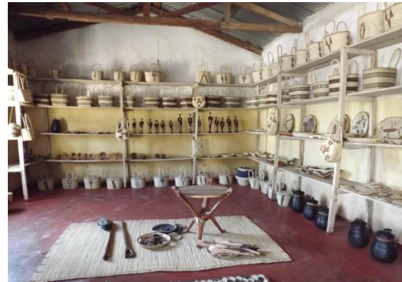
Mumwa Craft Association store Mongu

travel to the Mumwa Craft Association premises in Mongu where crafters will work intensively for several days until the order is complete. Members who participate are provided with transport, food, and a place to sleep for the duration of the work.