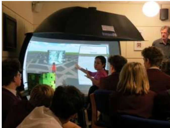
Figure 3: the final production model.

This SFP might have remained fiction if it hadn't been for a meeting with David J Aldridge the CEO of a small Essex based SME, Immersive Displays Ltd 3 , that produce virtual-reality environments such as flight simulators, planetariums and exhibition systems. Talking with them revealed they could build some aspects of the ePod now, albeit in a somewhat different form, as a student desk; the eDesk. The result was the product depicted in figures 2 & 3.