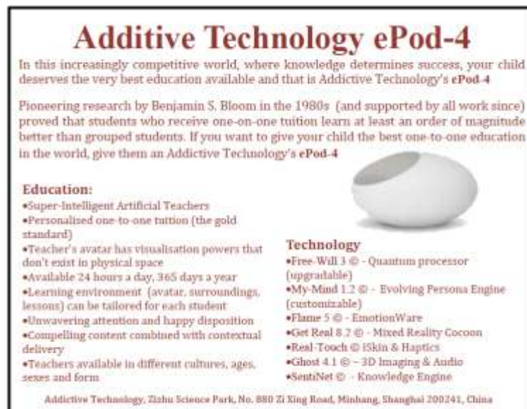
Figure 1: A fake sales brochure from the 'Tales from a pod' SFP

ePods were effectively small cocoons; something like a comfortable armchair enclosed within a sound-proof egg-like structure packed with sophisticated but largely invisible technology that included immersive mixed reality and sophisticated AI. The immersive reality technology aimed to make the participant feel as though they were truly part of a fictional physical world.