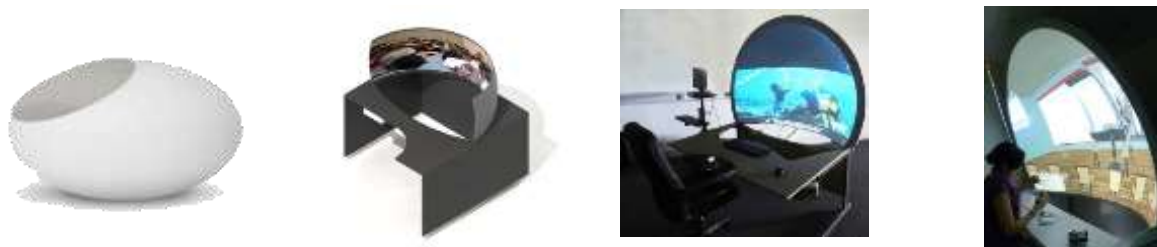
Figure 2: (from left to right) the original SFP egg-like concept, the eDesk concept, alpha prototype, beta-prototype

A fake product advertisement from the SFP is shown in Figure 1, illustrating the fidelity they seek to achieve. In addition to the story, SFPs can include supporting material such as product specifications, marketing material etc.