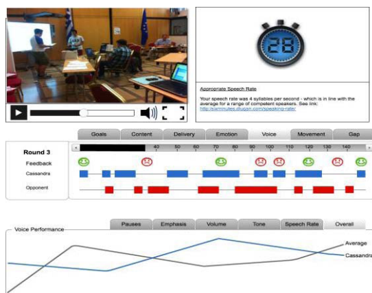
Figure 2. Metalogue About-action Dashboard screen mock-up.