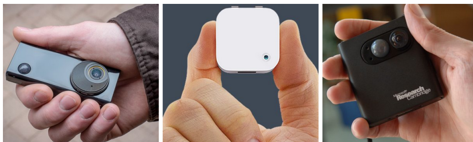
Figure 1: Three lifelogging devices: the Autographer, Narrative Clip and SenseCam.

not all of these desirable properties. The most prominent devices are probably the “Autographer” and the “Narrative Clip” [32] (left and centre images of figure 1). The Autographer was developed based on technology licensed from the SenseCam project and represents a logical continuation of it. It is smaller and lighter, features a 5 megapixel camera with a 136-degree wide-angle lens and can take up to 2,000 photos a day which are stored in its 8GB internal memory. It also has sensors to detect changing light levels, temperature, motion and orientation, as well as a GPS receiver ensuring that photos are geo-tagged. The Narrative Clip instead was developed independently with a slightly different focus in mind. In contrast to the distorted images coming from a fisheye lens, its moderate wide-angle lens (70-degree) provides “normal” pictures that are comparable to a mobile phone camera. While this means that it is unable to capture quite as much of the wearer’s surroundings, its pictures are much more “shareable” with others. It is also significantly smaller than the Autographer, making it not only easier to wear but also much more unobtrusive. However, as a result of its miniaturisation, the Clip not only has fewer sensors, but also lacks direct support for GPS data: to save battery, the Clip records raw signal strength data, which needs to be uploaded to company servers in order to be converted into actual coordinates.