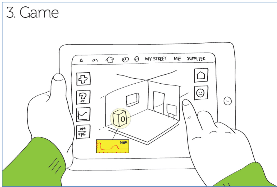
Fig. 3. The concept board shown to focus groups depicting the gamification service.

be formed of pre-existing groups, and could be geographical (e.g., a local primary school) or virtual (e.g., Mumsnet). The communities' energy saving webpage could also be linked to social media for those community members that would like to be involved in this way, and members could access and share their performance online via these forums. The community collectively identifies a reward they would like to collect points for (e.g., new playground equipment for their nursery) and are eventually rewarded with this by the energy supplier(s) when they meet their target. Progress towards the target would be updated automatically on the website and community group members could offer each other energy-saving tips and encouragement.