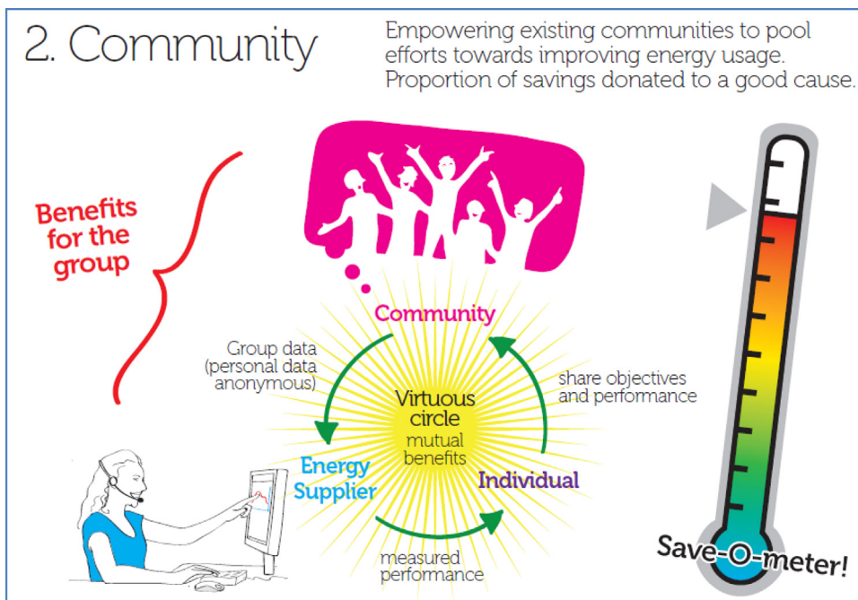
Fig. 2. The concept board shown to focus groups depicting the community rewards service.

Community members will be able to sign up for a web-supported service that enables them to gain community points for their personal household energy behaviours, on an opt-in basis. Members have the choice to be identifiable by other members of the community or remain anonymous. These communities would