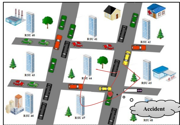
Fig. 1. An example of the process of responding to cases of emergency on the road

In our research, we simulate an intelligent intrusion detection system that is mounted directly in the vehicles rather than the RSUs, allowing for protection from potential attacks even when no RSUs are in the vicinity.