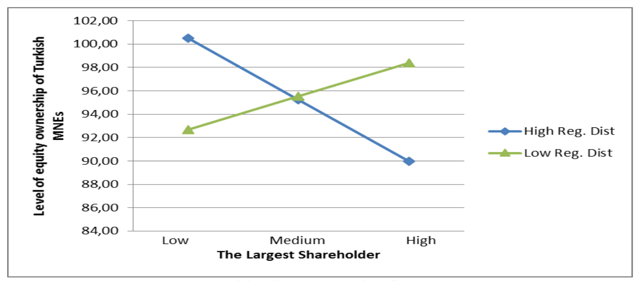
Fig. 2a. The interaction between CONCEN and REGDIST