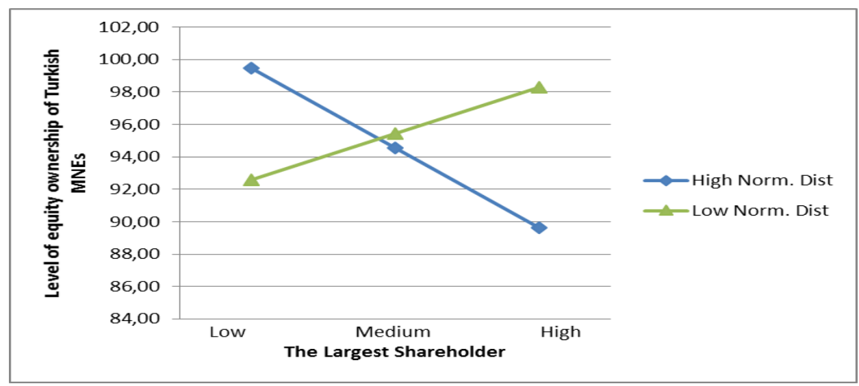
Fig. 2b. The interaction between CONCEN and NRMDIST