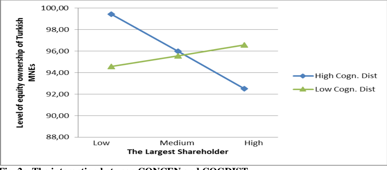
Fig. 2c. The interaction between CONCEN and COGDIST