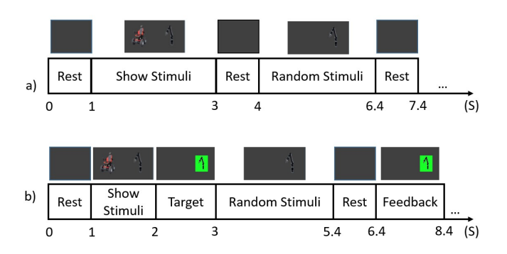
Figure 3. Timeline of a sequence. (a) Training stage. (b) Test stage.

GPU and Microsoft Windows 10 as operating system. Signal and Image processing are done using Matlab software (MathWorks, Inc).