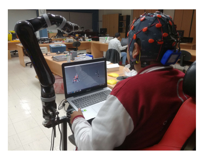
Figure 5. Participant testing the proposed assistive system.

The robot speed was calculated experimentally to have a smooth movement.