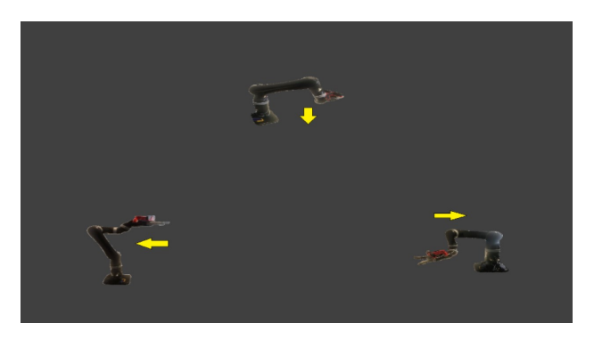
Figure 2. Images used as stimuli in the second level of BMI test stage.