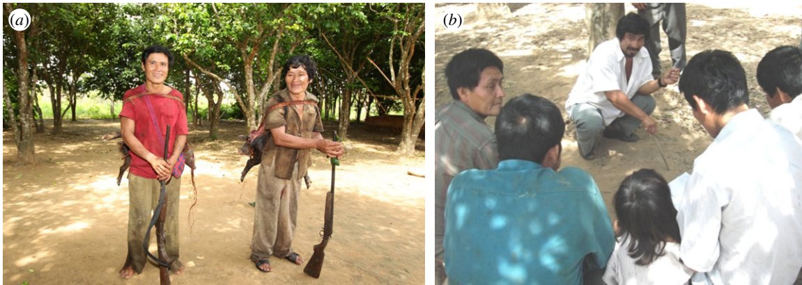
Figure 1. (a) Two Tsimane men returning from a hunt; (b) Tsimane man helping resolve a dispute over land, which is illustrative of the largely informal way in which political influence operates in this society. (Online version in colour.)

experience other advantages owing to their status [28]. Status can be self-reinforcing. Second, the status may motivate continued generosity, in order to signal that one's status is justified or one's leadership is trustworthy [29]. Such generosity on the part of high-status individuals may become normative, i.e. 'noblesse oblige' [30]. Third, cooperation by high-status individuals may motivate cooperation by other group members, owing to prestige-biased imitation [31,32]. Fourth, by forming cooperative partnerships with high-status individuals, group members elevate their own status by gaining access to high-status individuals' information [10], resources or coalitions.