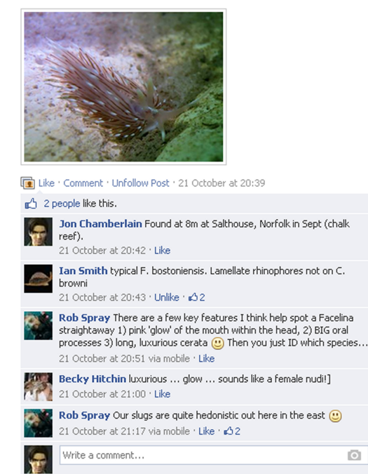
<u>Figure 1.</u> Example of how an image classification task is solved through discussion on Facebook groups.

I was thinking this was Coryphella browni, but someone suggested it might be Facellina bostoniensis due to the long tentacles and more upright rhinophores. Any thoughts?