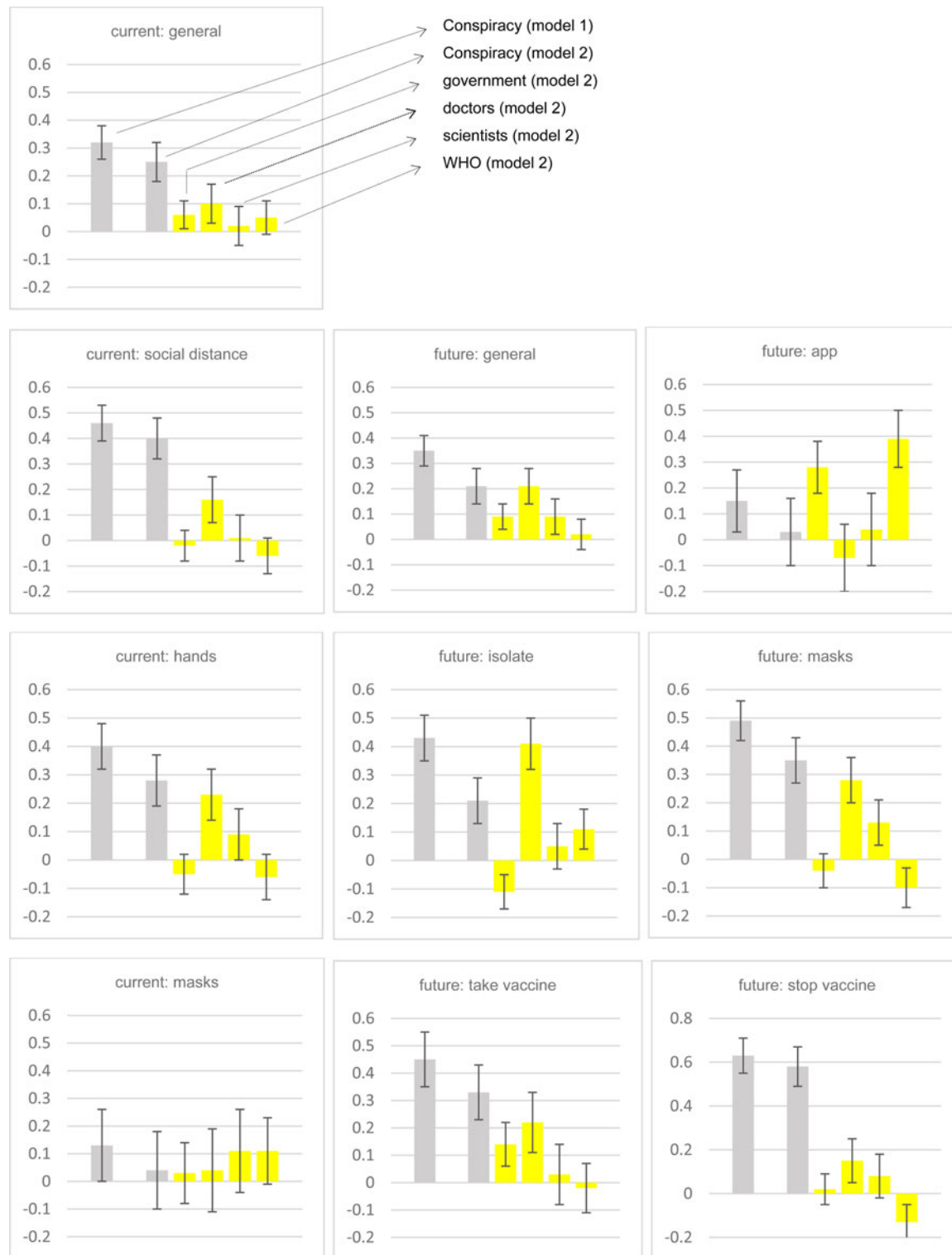
Fig. 3. Effect of pro-conspiracy beliefs on adherence, without (model 1) and with (model 2) distrust variables.

Note: all predictor and outcome measures are coded 0-1, co-efficients and 95% confidence intervals reported from OLS regressions (see online Supplementary materials for full details). For some adherence measures (e.g. future: isolate) trust variables reduce conspiracy effect, and not others (e.g. stop vaccine). Partial confirmation of Hypothesis 5.