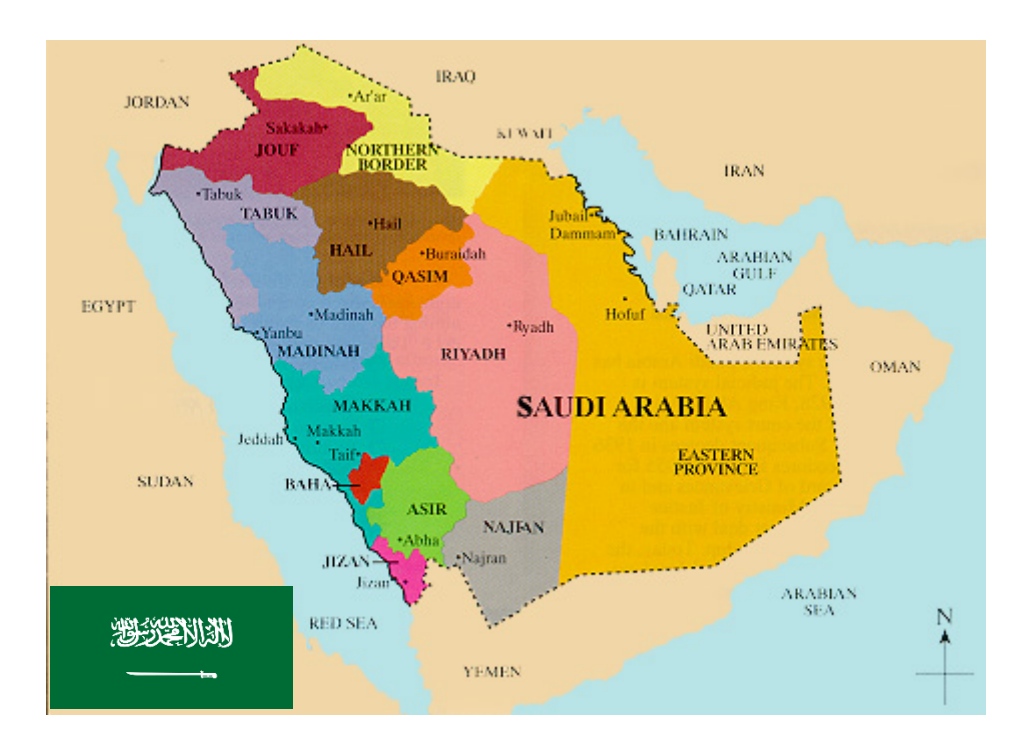
Figure 1. KSA administration districts

KSA has 13 administration districts: Qassim, Riyadh, Tabuk, Madinah, Makkah, Northern Borders, Jawf, Ha'il, Bahah, Jizan, Asir, Najran, and Eastern Province. The capital Riyadh is in the country's centre. The KSA has large deserts, but districts like Ha'il, Asir, and Bahah have incredible nature. The districts also have different customs. For example, Hijazi people's customs, like in Mecca and Jeddah, differ from those of the Bedouins, who used to live in isolation in the deserts.