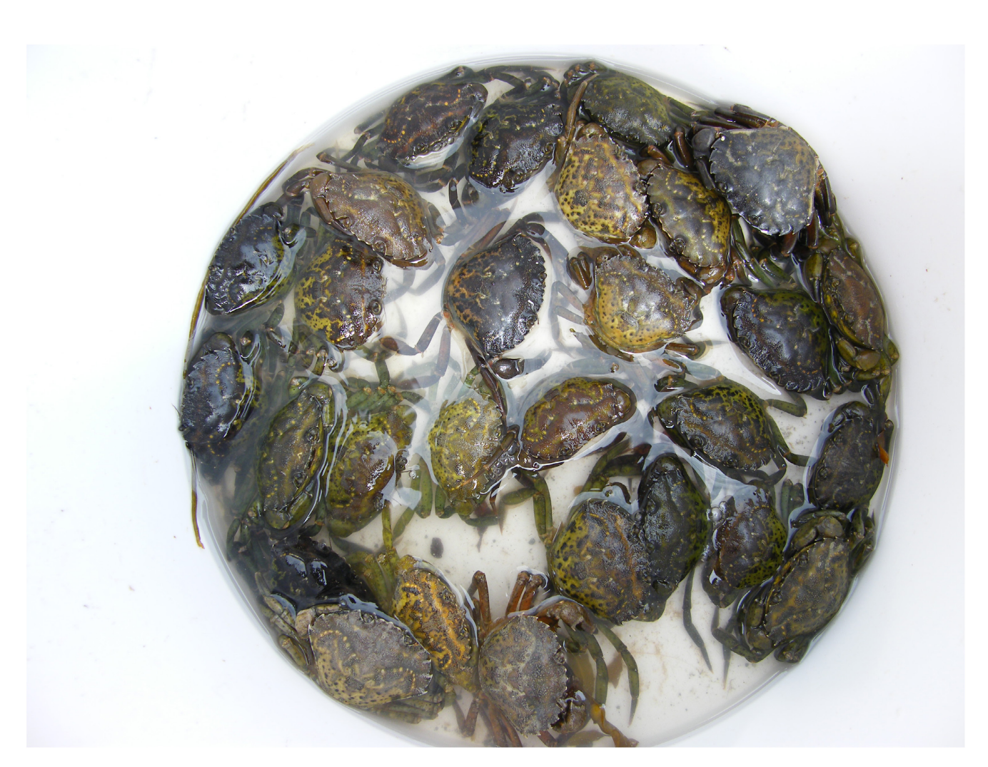
Photo 3. Success! Green shore crabs ( Carcinus maenas ), ready to be added to treatments in the caging experiments.