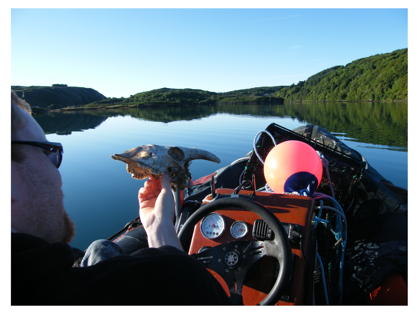
Photo 2. To fish or not to fish: preparing to set some creel pots to capture the predators for the experiments.