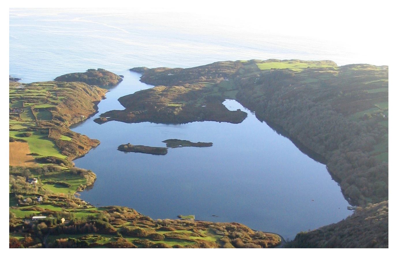
Photo I. Aerial view of Lough Hyne marine reserve, highlighting its sheltered nature due to a narrow connection to the open coast.