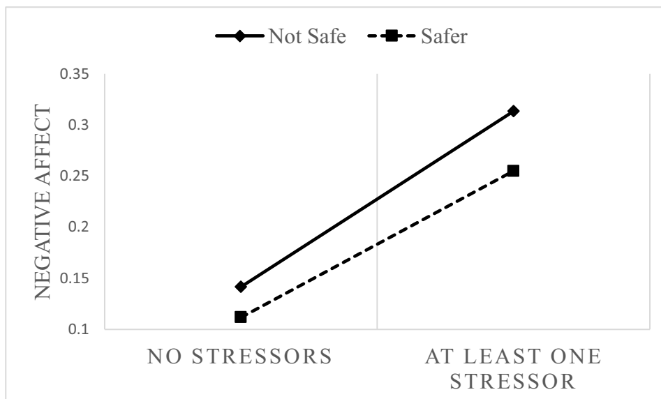
Fig. 1. Neighborhood safety x stressor interaction in relation to negative affect among midlife and older adults. A dichotomous perceived neighborhood safety variable was constructed for visualization purposes only, where individuals providing the highest rating of neighborhood safety (a value of 4 on a 1-4 scale) were coded as Safe, and all others were coded as Not Safe, given the strong skewness of the neighborhood safety variable. Figure adjusted for race/ethnicity, individual education, sex, age, levels of neuroticism, neighborhood income, mean number of stressors over the diary period, weekday versus weekend day, and chronic stressors in childhood, adulthood, and over the lifespan as well as interactions between these sources of chronic stress and self-reported daily stressors.

Neighborhood Perceptions. Neighborhood safety concerns do not represent a derived variable, nor does it summarize the characteristics of a group of people living in the same neighborhood, such as the case with neighborhood socioeconomic status. (Diez Roux, 2003) Instead, these perceptions represent a rating of the neighborhood context, albeit from the viewpoint of the residents, and therefore subjective in nature. (Diez Roux and Mair, 2010) Some researchers argue that assessments of neighborhood safety require the perspectives of local residents, and direct observation is not necessary or even appropriate. 18 Residents spend a more significant amount of time in their respective neighborhoods than do researchers who make brief observations, and the most pernicious cues of disorder or threats of harm likely appear after dark