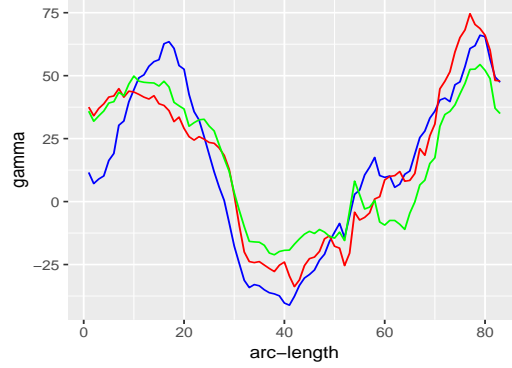
Fig. 2 Estimators of \gamma with different expected missing length on [0, 1] . Blue line: the estimator using original complete dataset; Red line: the estimator with (a_1, a_2) = (1.5, 0.2) ; Green line: the estimator with (a_1, a_2) = (1.5, 0.4)

dataset with different missing domain (red line and green line) are similar to the estimator obtained from original complete dataset (blue line). This reveals that the proposed framework is useful in getting an estimator for the model with incomplete functional predictors.