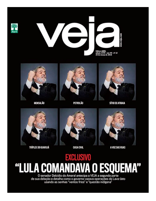
Figure 4. issue 23/03/2016.

affirmed within financial sectors, leading brokers and investment firms to make deals to profit from Rousseff's downfall.