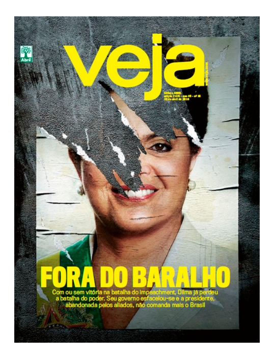
Figure 5. issue 20/04/2016.

defending the interests of the Brazilian people against the left-populist menace. Moreover, the highly charged character of the descriptions and images related to the construction of villains and hero through the signifiers 'populis*' is palpable. The affective overinvestment in these signifiers and their associations with moral corruption and immature profligate spending of others' money indicates that something more is at stake beyond a perceived threat to principles of free market economy, namely, an enjoyment linked to an ontology of lack (to be discussed further later). In what follows, we explore how the appearance of Jair Bolsonaro on the scene gives Veja the opportunity to affirm an antipopulist horseshoe hypothesis.