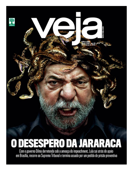
Figure 3. issue 16/03/2016.

scenario, Veja warned that if Lula were to prevail, the 'social chaos [in Brazil] will be enormous' (09/03/2016, 24). An opportunity to amplify this horrific dimension emerged soon enough, following the leaking by Moro of a 'revealing' phone call between Lula and Rousseff, which appeared to suggest that Lula would be appointed as the new chief of staff. The news had a striking impact and was splashed across Veja 's pages. Alarming its readers with the significance of such a move by Rousseff's government, the magazine announced the regrettable beginning of 'Lula's third presidential mandate' (23/03/2016a, 49).