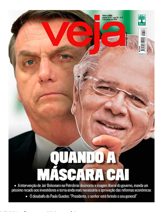
Figure 12. issue 03/03/2021.

It is of course true that there is nothing intrinsic to the hero/villain narrative structure that predetermines its political expression as necessarily populist or indeed anti-populist. In other words, the link between hero/villain narrative structure on the one hand, and