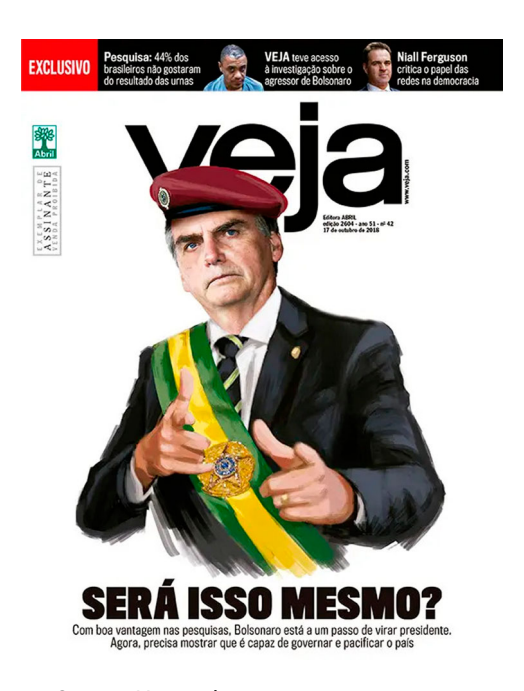
Figure 8. issue 17/10/2018.

Already amidst Bolsonaro's victory, Veja struck a much more optimistic tone in offering its assessment of Brazil's political and economic prospects. It was keen to point out, for example, that while Bolsonaro's figure may 'resemble that of Silvio Berlusconi, a rightwing populist', the Italian and Brazilian conditions were completely different. This was