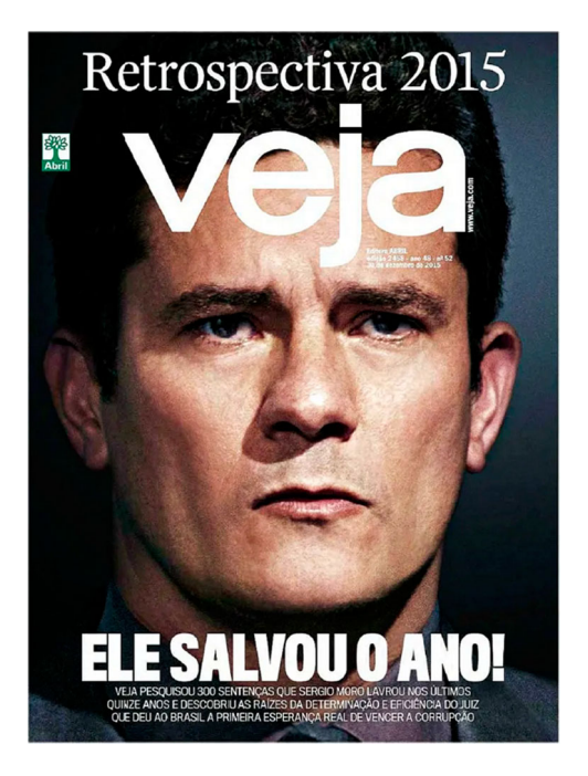
Figure 1. issue 30/12/2015.

Seen as a 'rickety' political force in 1980 (23/01/1980, 27), PT was described in 2015 by Veja as the 'Brazilian people's foremost enemy' (12/08/2015a, p. 42 and 43), vividly portrayed under the cover headline 'Brazil calls out for help' (12/08/2015). Warning its readers about Rousseff's credibility deficit, Veja announced that the Lava Jato investigation would soon bring to light extraordinarily incriminating evidence, and pointed to 'the beginning of the end of a cycle of populism and corruption that devastated Brazil' (12/08/2015b, 51).