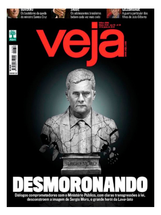
Figure 11. issue 19/06/2019.

It is of course true that there is nothing intrinsic to the hero/villain narrative structure that predetermines its political expression as necessarily populist or indeed anti-populist. In other words, the link between hero/villain narrative structure on the one hand, and