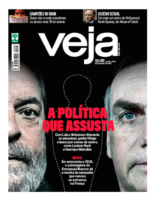
Figure 6. issue 8/11/2017.

By following the signifiers 'populis*' we have identified the main elements of Veja's fantasmatic narrative of this period, supplementing our account with references to selected cover images that demonstrate the highly charged investment in key villains (Lula, Roussef, Bolsonaro) and hero-quarantors (Moro and Temer). Moral corruption and state interventionism remain central meanings associated with the signifiers 'populis*', employed as a means of elevating the market-rule principle and ideal in Veja's storyline. However, we have also seen how the attachment to this ideal was strengthened by the threat Bolsonaro posed, whose alleged interventionism rested less on redistributive than on protectionist mechanisms, thereby erecting a different set of political barriers to market dynamics.