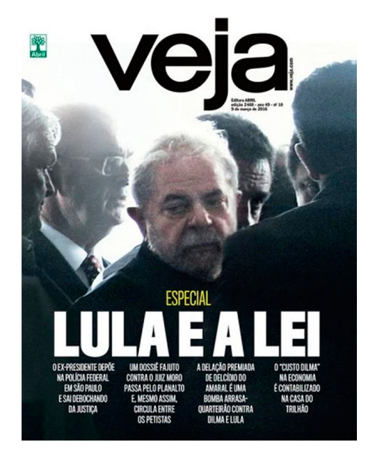
Figure 2. issue 09/03/2016.

government has disastrous consequences for the electricity sector and the consumer' (10/02/2016, 78). Lula had based his 'distributive populism' on the commodity boom, but Rousseff would have to make use of different means to keep her 'foolish [interventionist] measures' afloat (03/02/2016, 10). According to the magazine, not only did these measures go against the laws governing the 'creation of wealth', but they proved that 'populist regimes last only as long as other people's money' (ibid.).