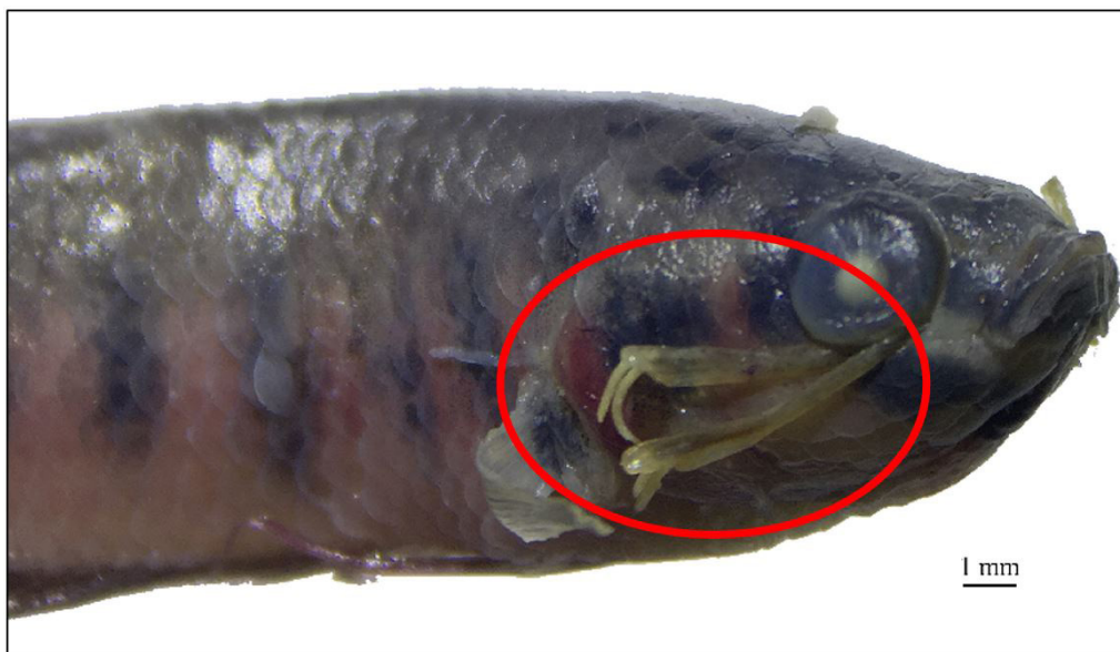
Figure 2. Betta rubra specimen infected by the anchor worm, Lernaea cyprinacea . The parasite is highlighted in the red circle.