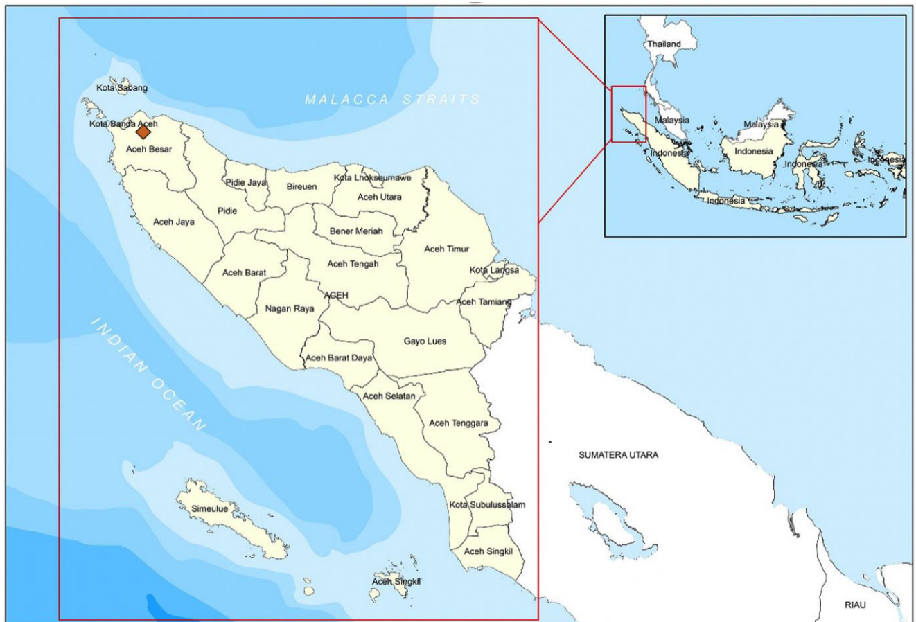
Figure 1. The map of Aceh province showed the sampling location (highlighted in red box). Indonesia map insert.

(4 °C) for 5 min, then preserved in 10% formalin (Nur et al., 2022a). These procedures were conducted in compliance with Research Ethics Guideline of Universitas Syiah Kuala No. 958/2015.