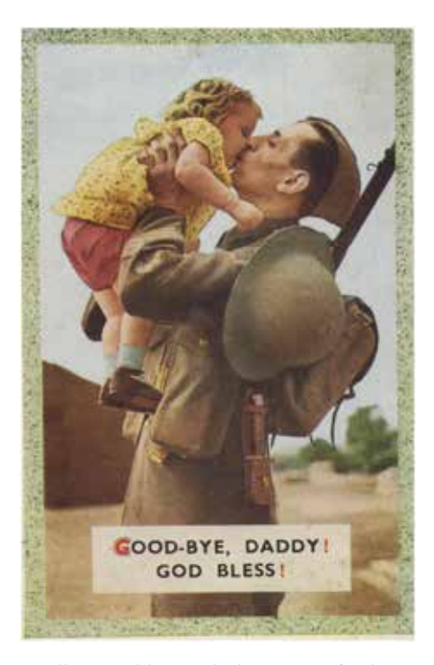
Figure 1.2 'Goodbye Daddy! God Bless!', Bamforth & Co. postcard.

I prayed so hard, I thought, 'This is going to happen.' And I remember the ... [laughs] somebody knocking at the door, when my grandmother was there, and I thought, 'This is him!' And it was somebody came and said ... 'I've brought you some rhubarb! [laughs] I met your mother, and I said, "I've got some spare rhubarb!"' I always remember this wretched rhubarb! And I thought it was my father [laughs] having lost his memory, and suddenly remembered where he was. And when I was little, there used to be a lot of horses go by the ... our front garden ... well, our road, which fronts onto a road which went near to one of the ... well, two hospitals, where there were a lot of wounded Tommies, and soldiers recuperating, and I used to go to the gate and search all these men's faces, thinking, 'Perhaps one of them's my father, and he's forgotten where he is, who he is.' Of course, it wasn't.