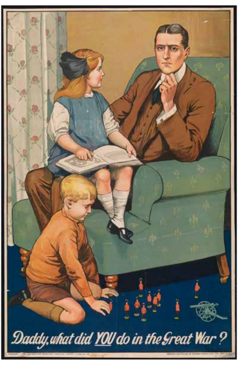
Figure 5.1 Savile Lumley recruitment poster, 'Daddy, what did you do in the Great War?' IWM Art, PST 0311. All rights reserved.