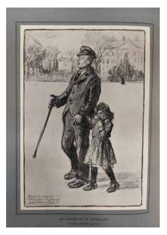
Figure 7.2 Louis Raemaker's sketch of a blind soldier and his guide.