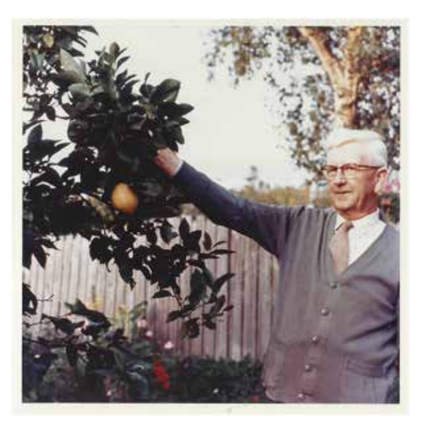
Figure 0.2 Granddad and his lemon tree, Surrey Hills, Melbourne, circa 1964.