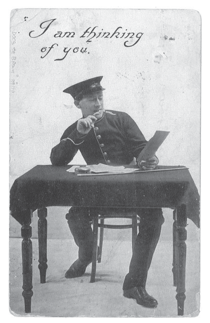
Fig. I. Postcard from S. E. Brown to mother, date illegible, papers of S. E. Brown, Department of Documents, Imperial War Museum, 89/7/1.

you'. A studio image, to the modern eye it seems stilted and the words even slightly comic. The soldier wears a braided uniform and he sits at a desk with an ostentatious quill pen; soldiers on active service were more likely to write home in pencil with notepaper balanced on their knees. This postcard is one of many depicting soldiers writing home. They evoke the apparent power of nostalgia to bring loved ones separated by war together (see Figures 2–4).