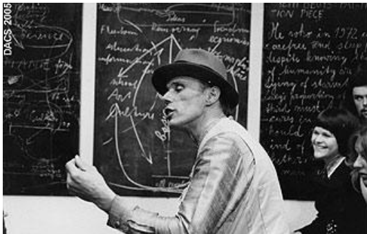
Figure 1: Joseph Beuys

Everyone is an artist. This would seem a simple enough place to begin; with a statement connecting directly to Joseph Beuys, and more generally to the historic avant-garde's aesthetic politics aiming to break down barriers between artistic production and everyday life. It invokes an artistic politics that runs through Dada to the Situationists, and meanders and dérives through various rivulets in the history of radical politics and social movement organizing. But let's pause for a second. While seemingly simple, there is much more to this one statement than presents itself. It is a