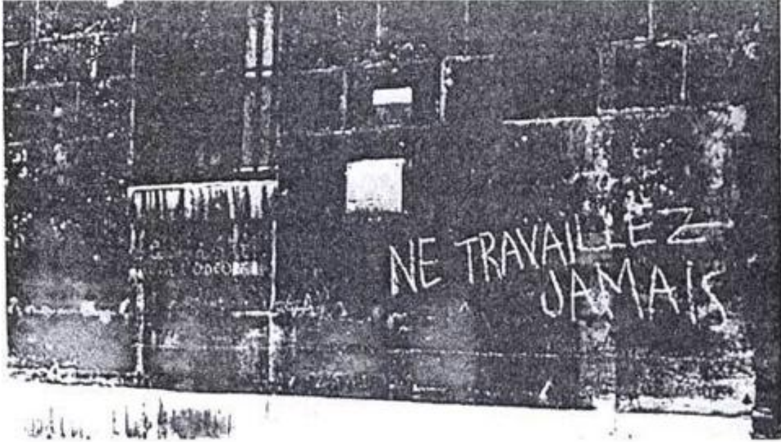
Programme préalable au mouvement situationniste.

Cette inscription, sur un mur de la rue de Seine, remonte aux premiers mois de 1953 (une inscription voisine qui relève de la politique traditionnelle aide à dater avec la plus sûre objectivité le tracé de celle qui nous intéresse : appelant à une manifestation contre le général Ridgway, elle ne peut donc être postérieure à mai 1952). L'inscription que nous reproduisons ici semble être la plus importante trace jamais relevée sur le site de Saint-Germain-des-Près, comme témoignage du mode de vie particulier qui a tenté de s'affirmer là.