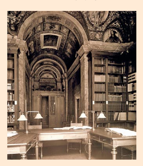
Part of the Bibliotheca Hertziana in the Palazzo Zuccari, Rome

All three lecture series remain to this day important elements of the Academy's programme of events.