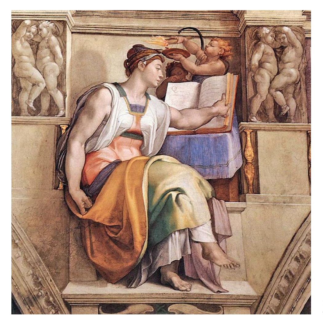
Figure 3. The Erythraean Sybil, Sistine Ceiling.

It has not been possible to do justice to the full range and significance of the Aspects of Art Lectures, nor to follow up the many interesting questions that have arisen. There is no doubt that they give a rich account of changes in taste, of the development of two disciplines over the last century and the ways these have been shaped by scholars.