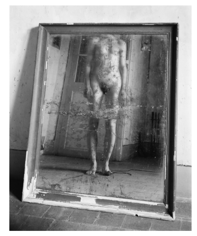
Model Study Nr. 6 2004 Photograph 105x85 cm